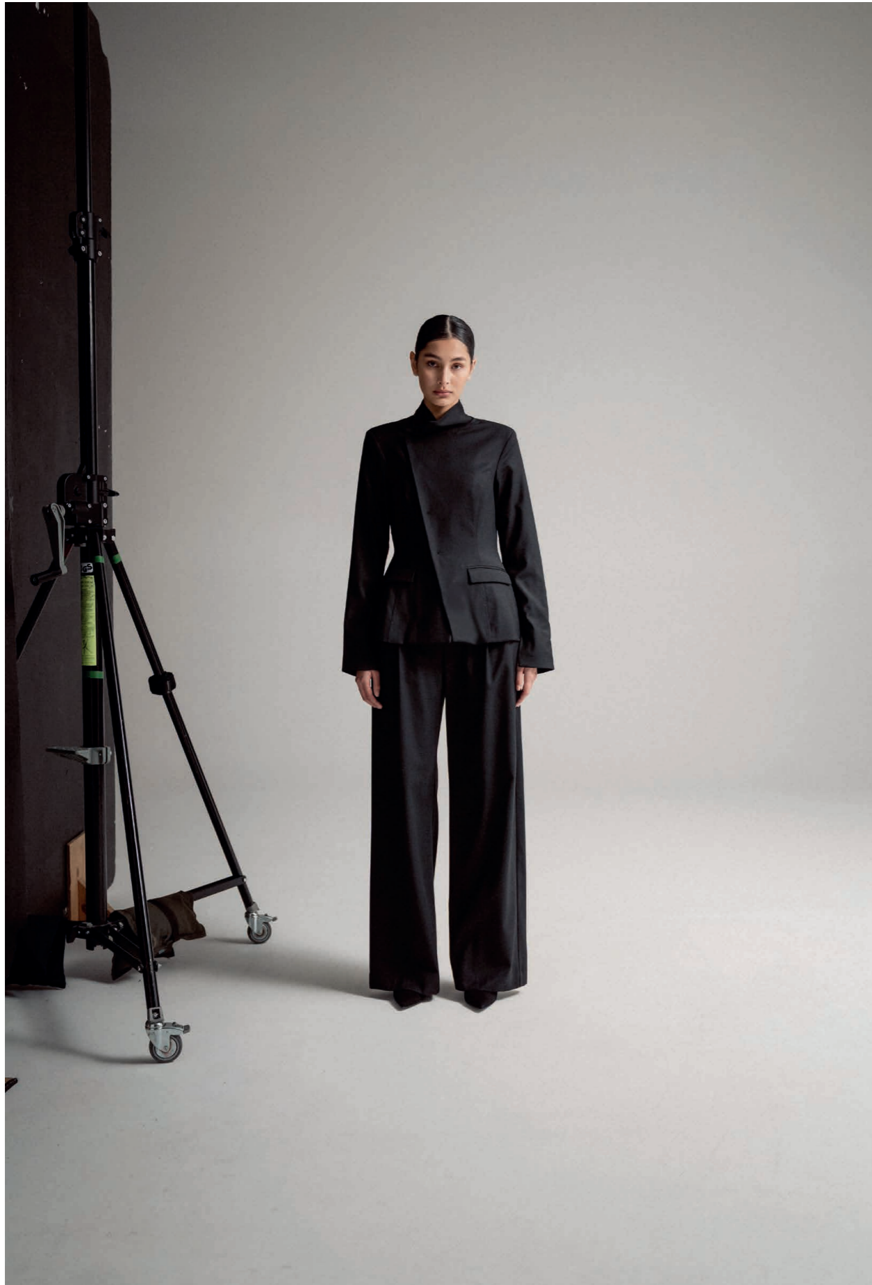
Daya wool blazer black, Mel heavy wool trousers black