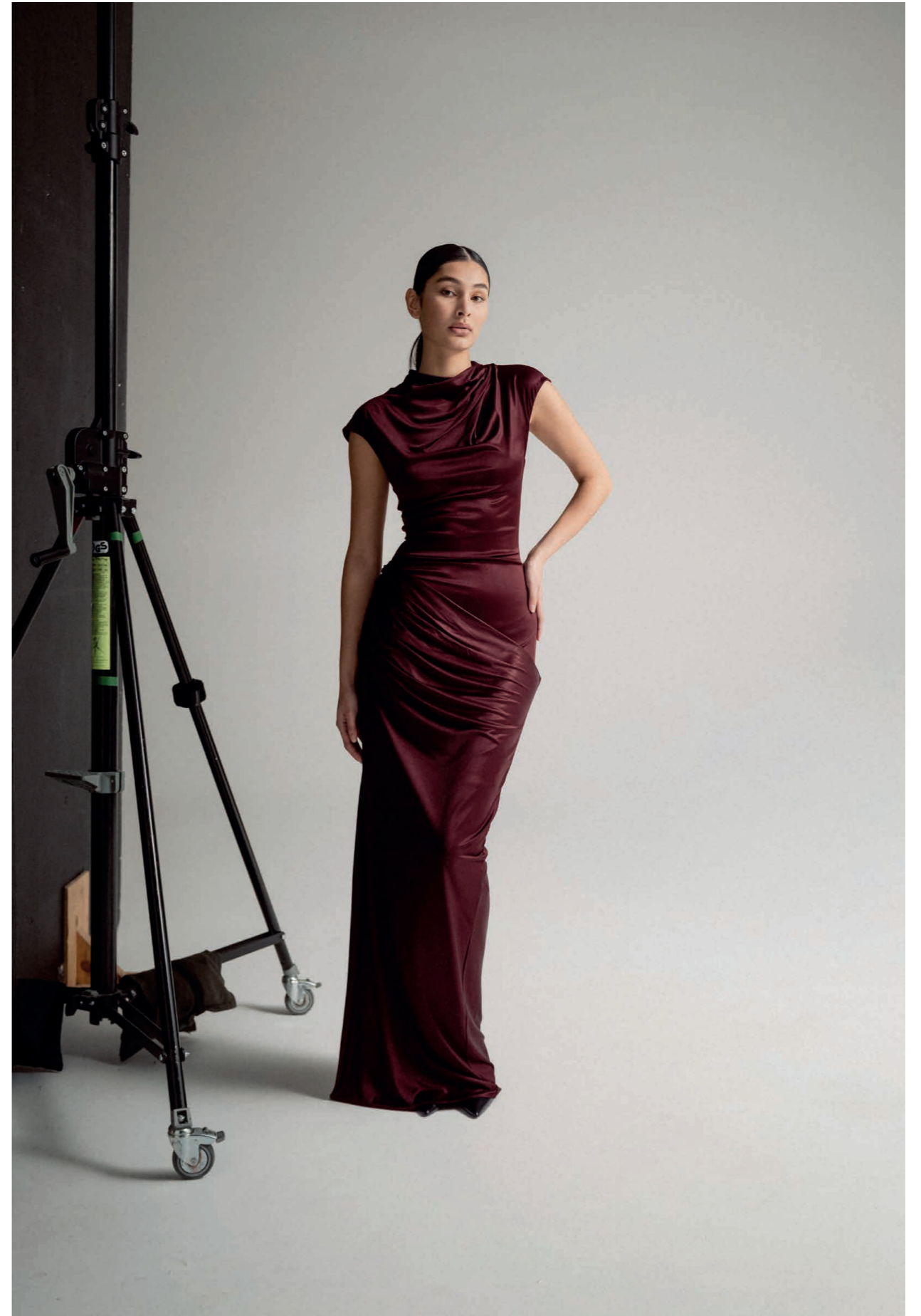
Nika jersey dress burgundy