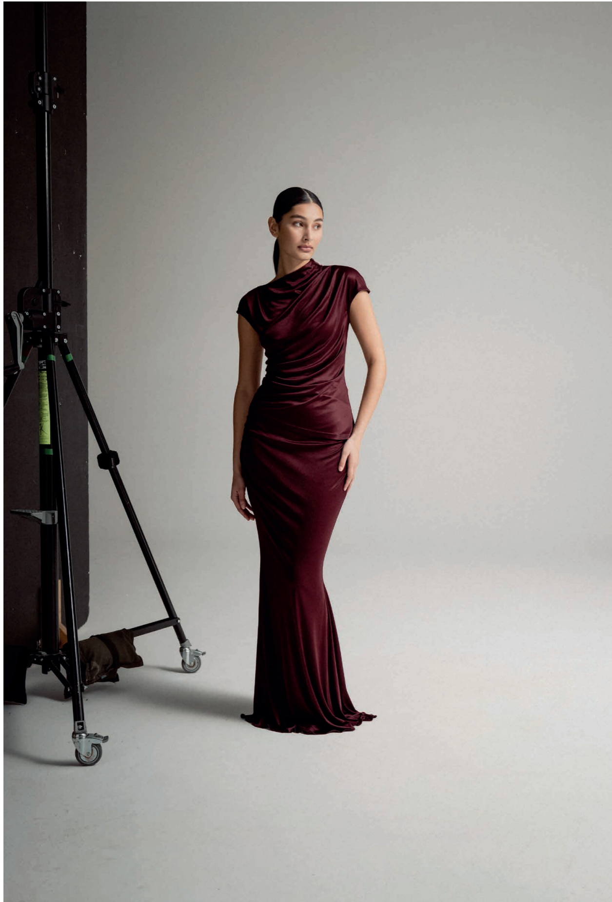
Lizi jersey top burgundy, Myra jersey skirt burgundy