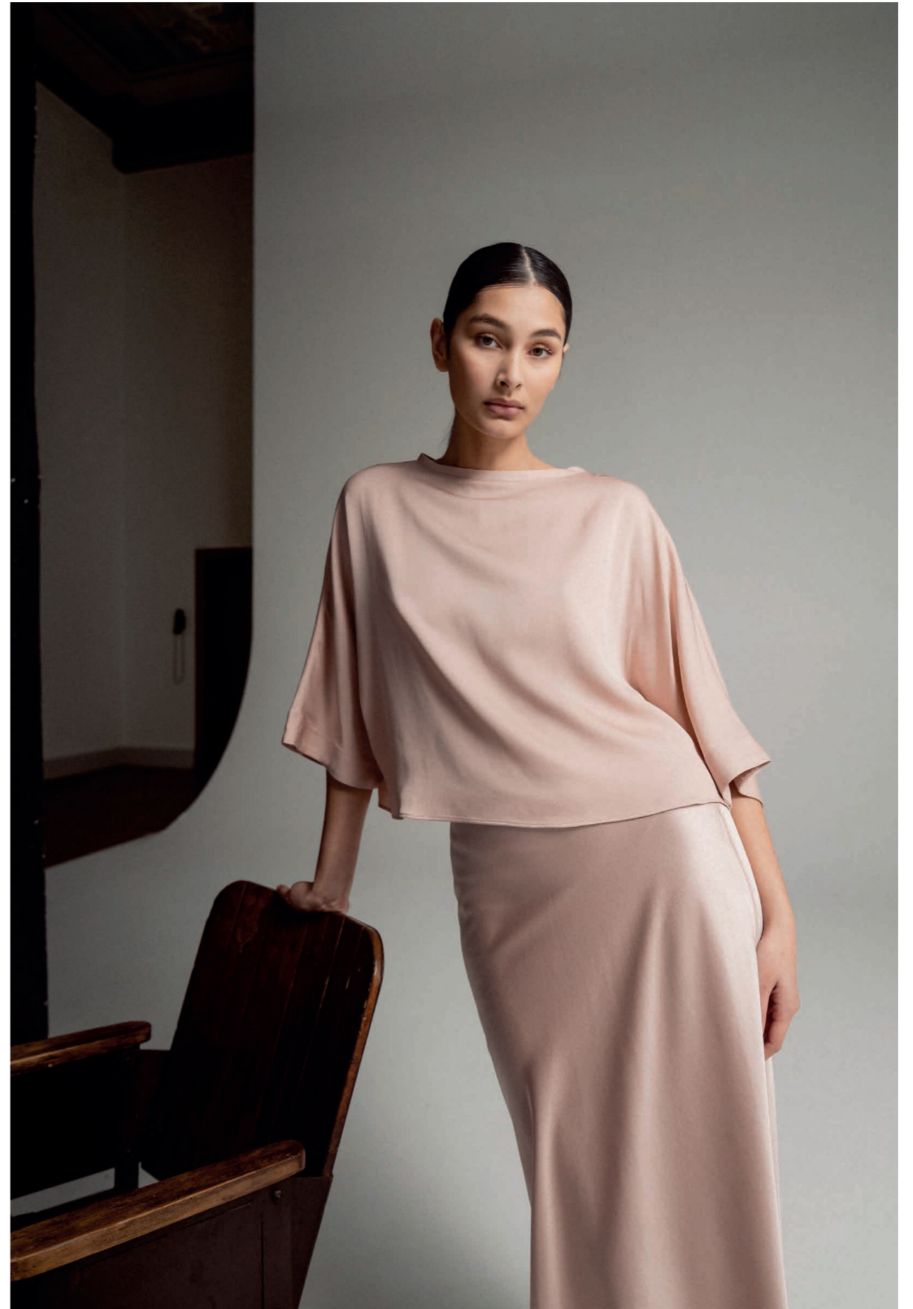
Thea silk tee dusty pink, Hana satin silk skirt dusty pink