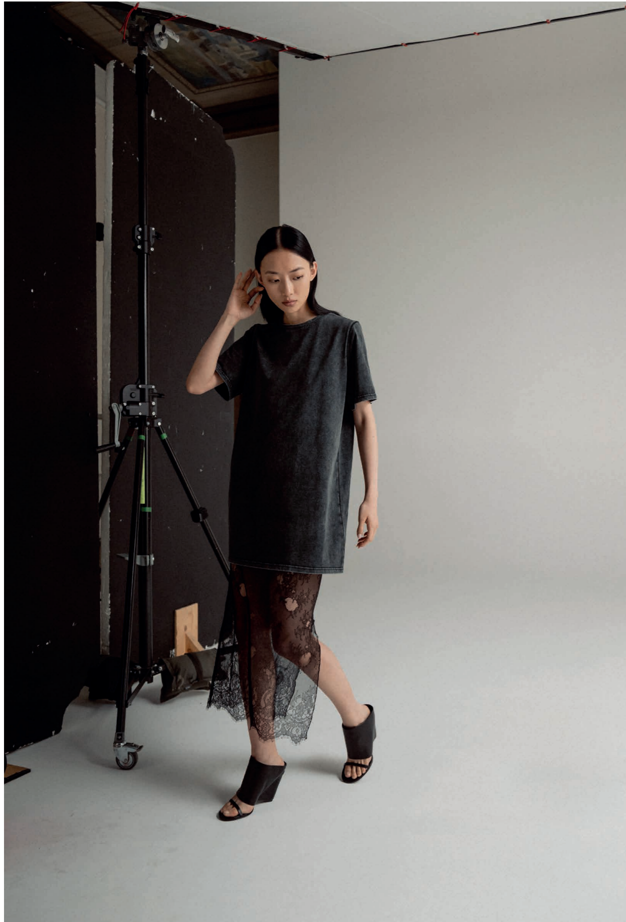
Oki long tee washed black, Hana lace pencil skirt black