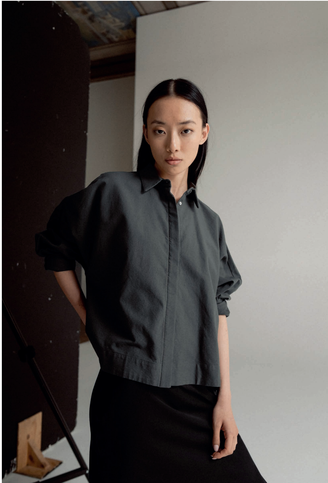
Gigi oxford shirt wood