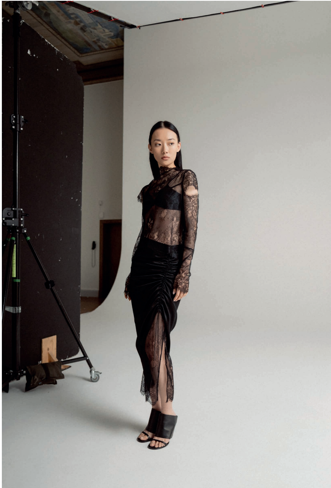
Edina lace blouse black, Haley lace skirt black