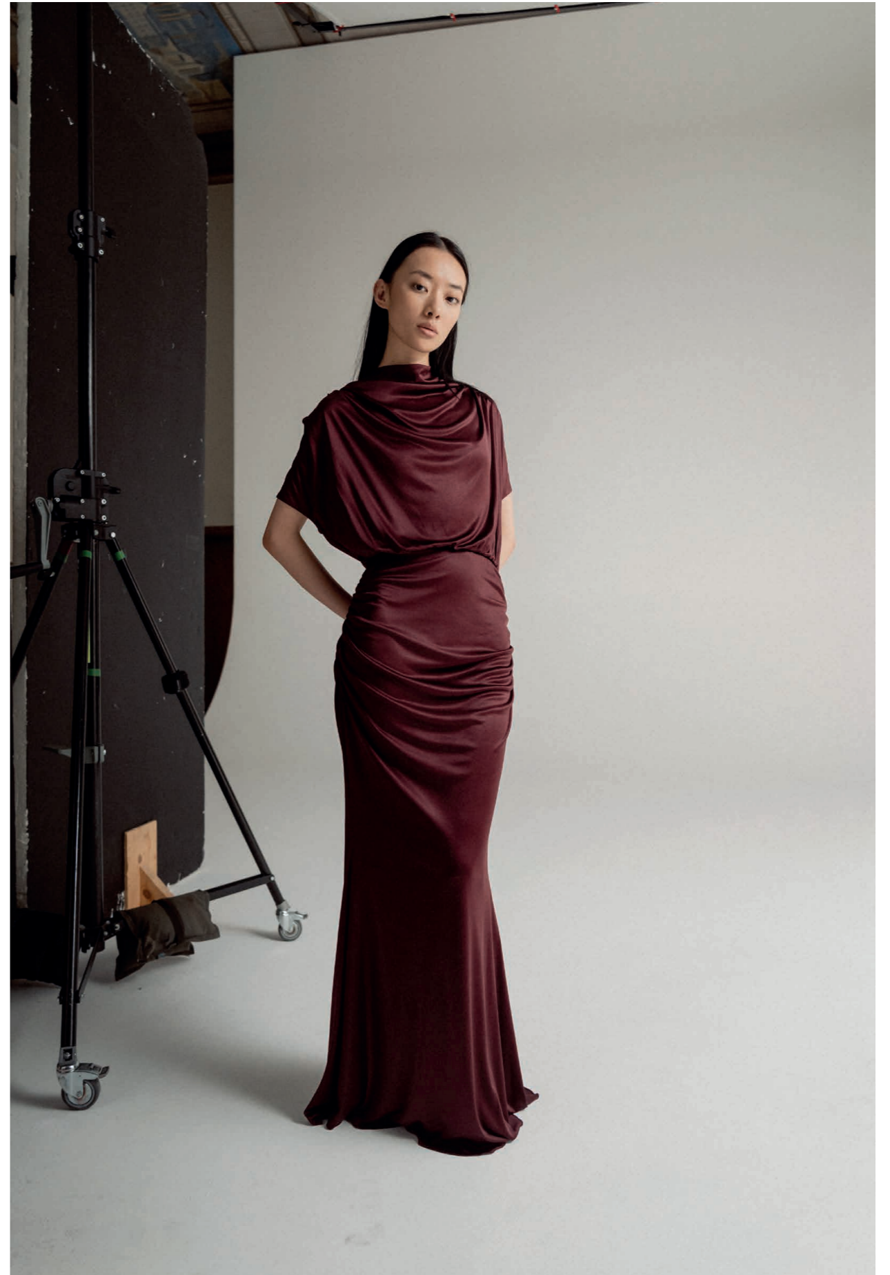
Miya jersey dress burgundy