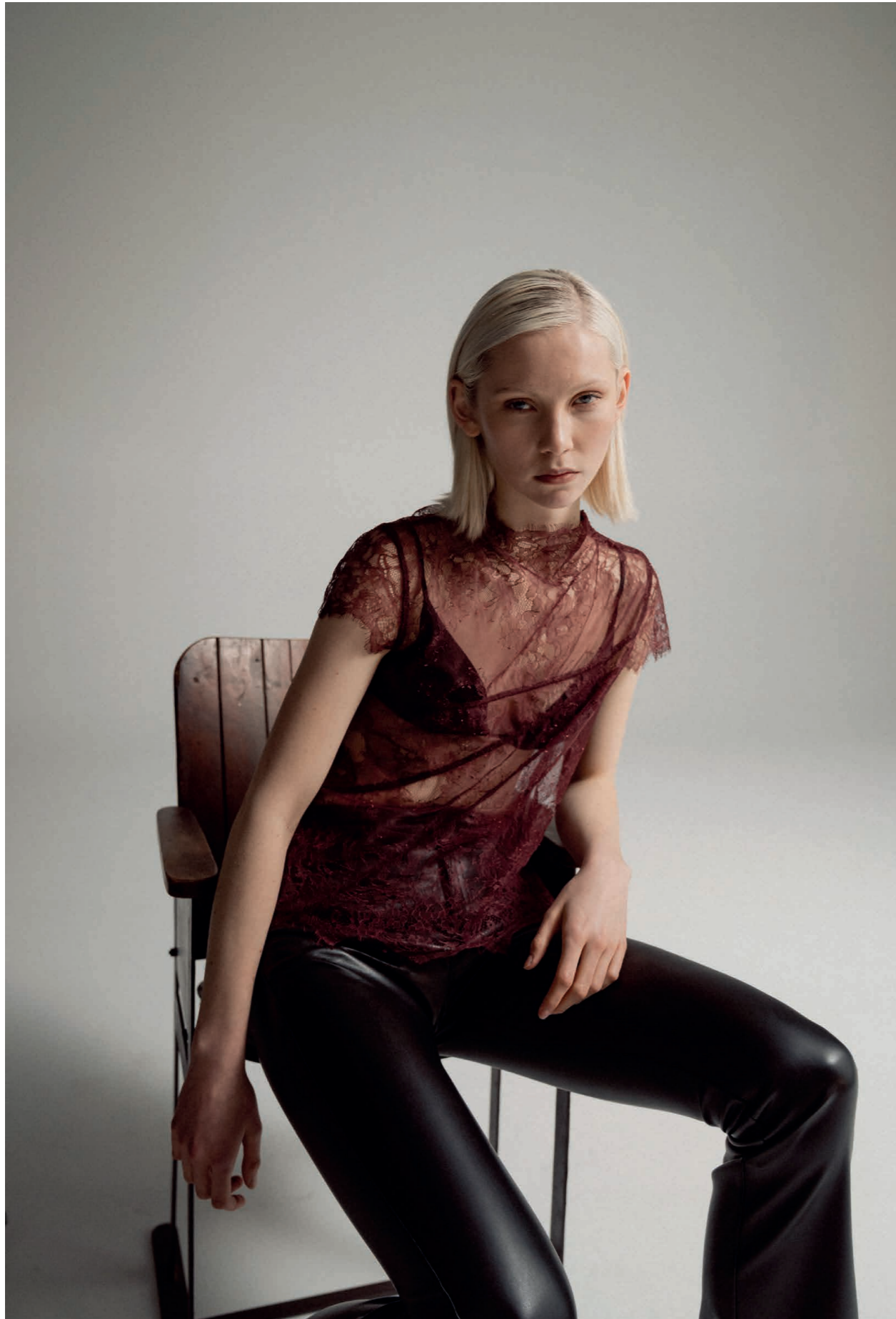
Eden lace top burgundy, Aiko PU leather trousers black