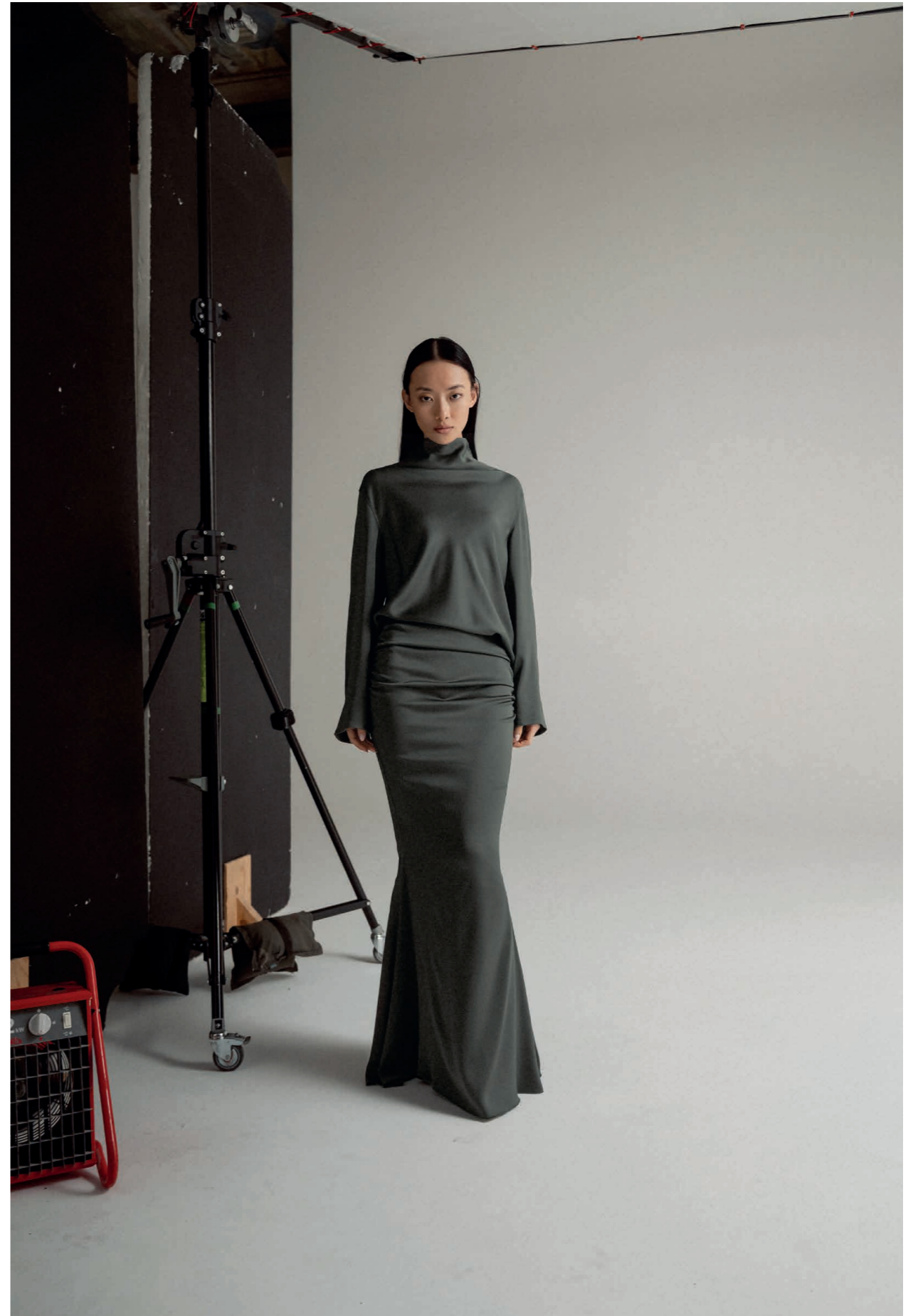
Ari blouse wood, Myra skirt wood