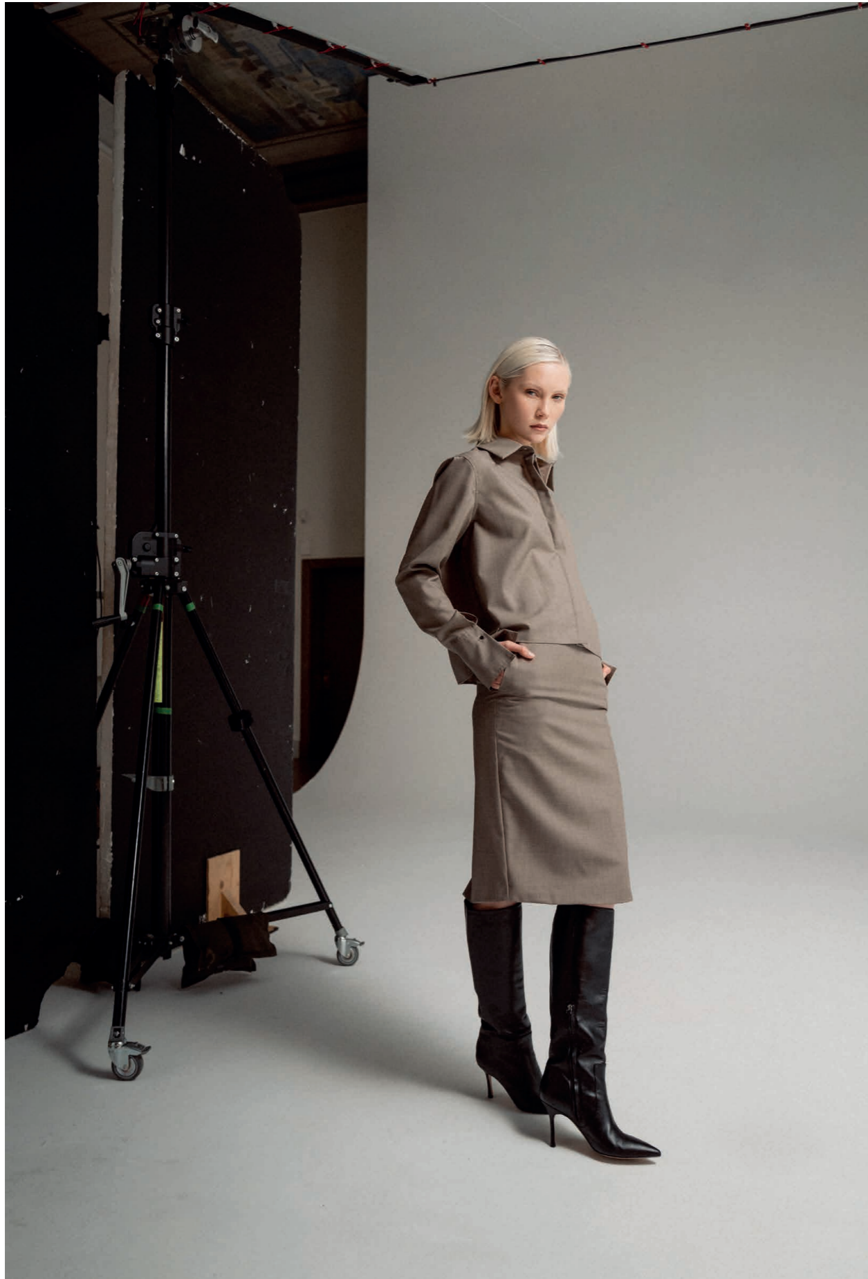
Mindi wool shirt light brown, Ava wool skirt light brown