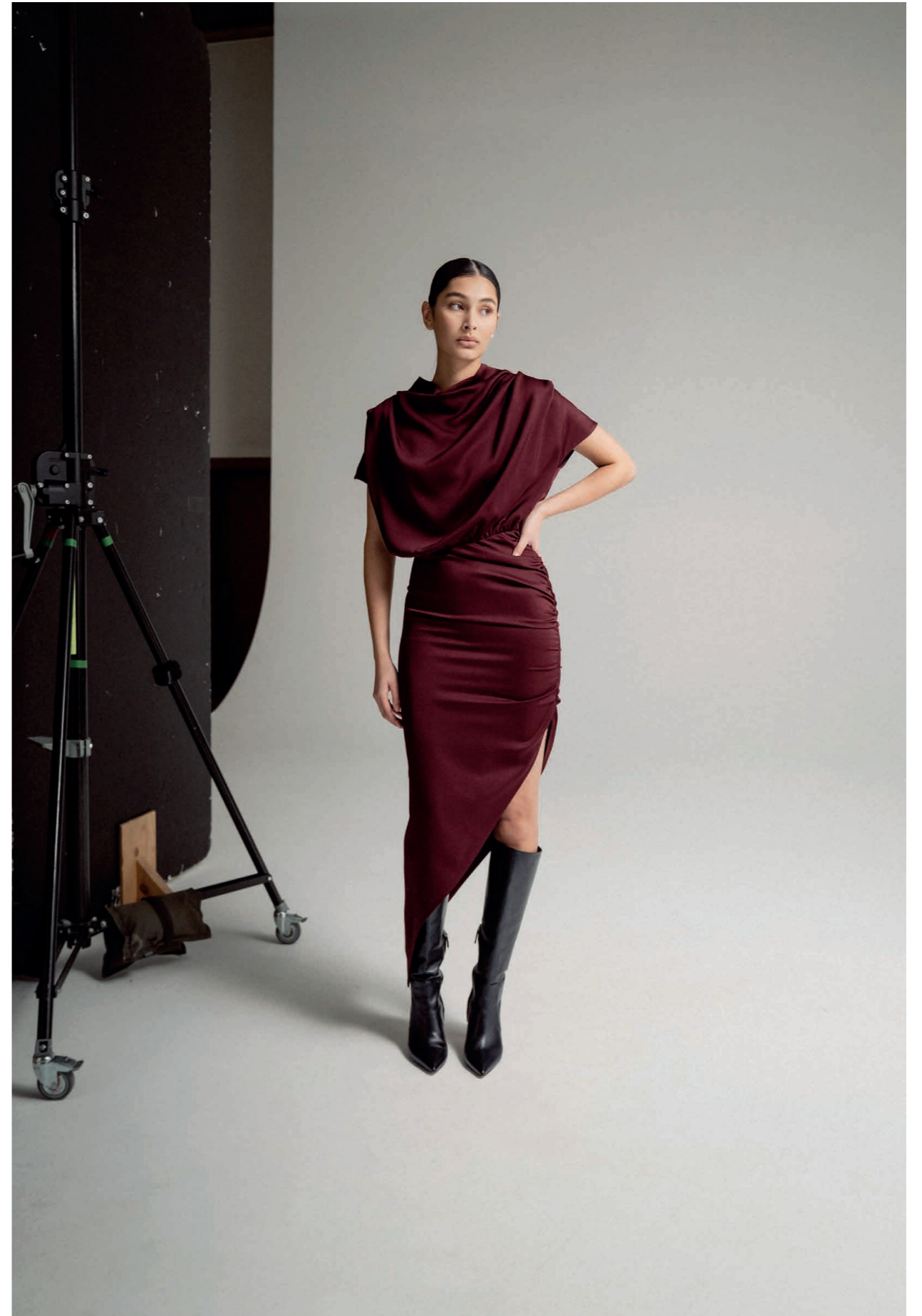
Minou dress burgundy