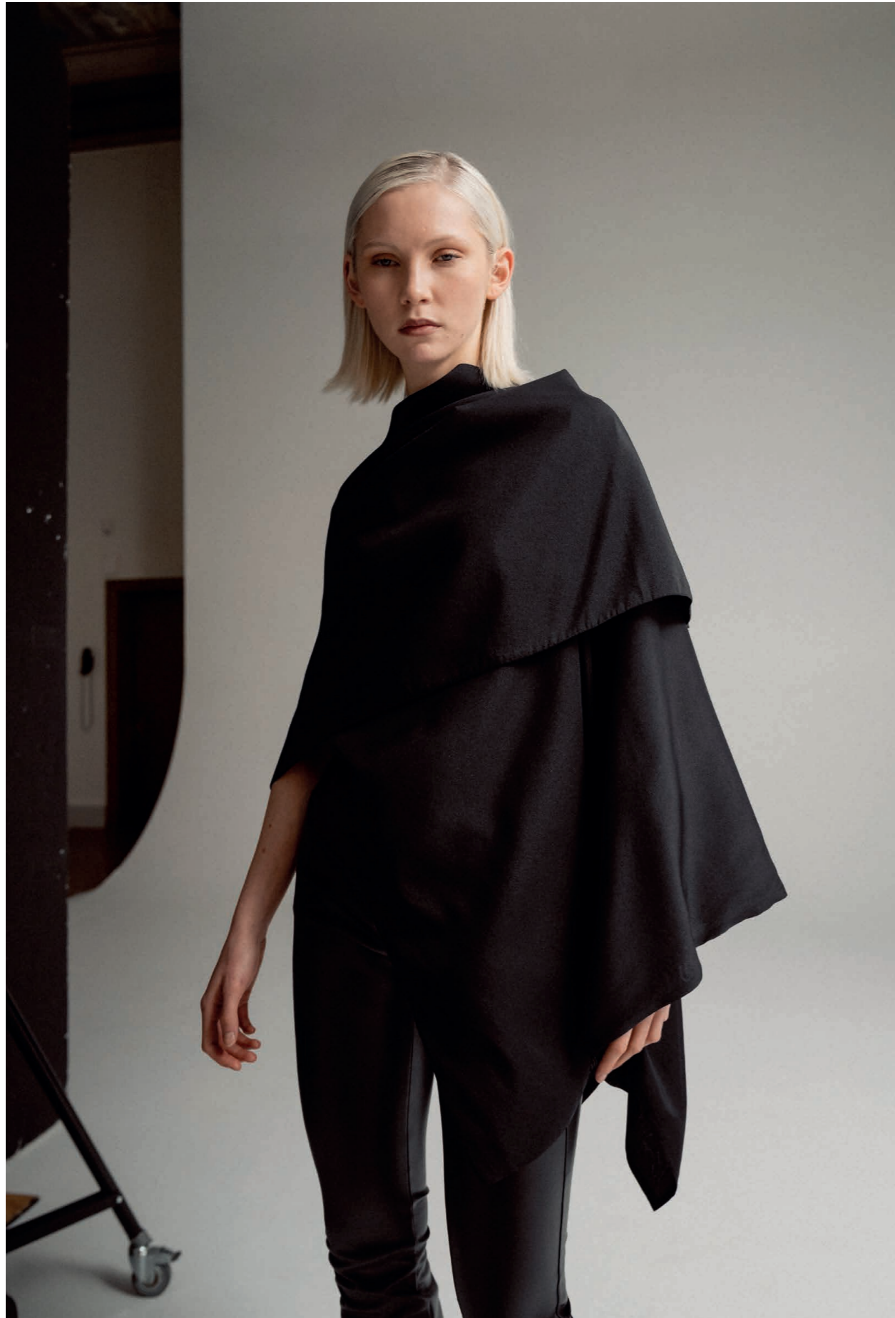
Niki cape black