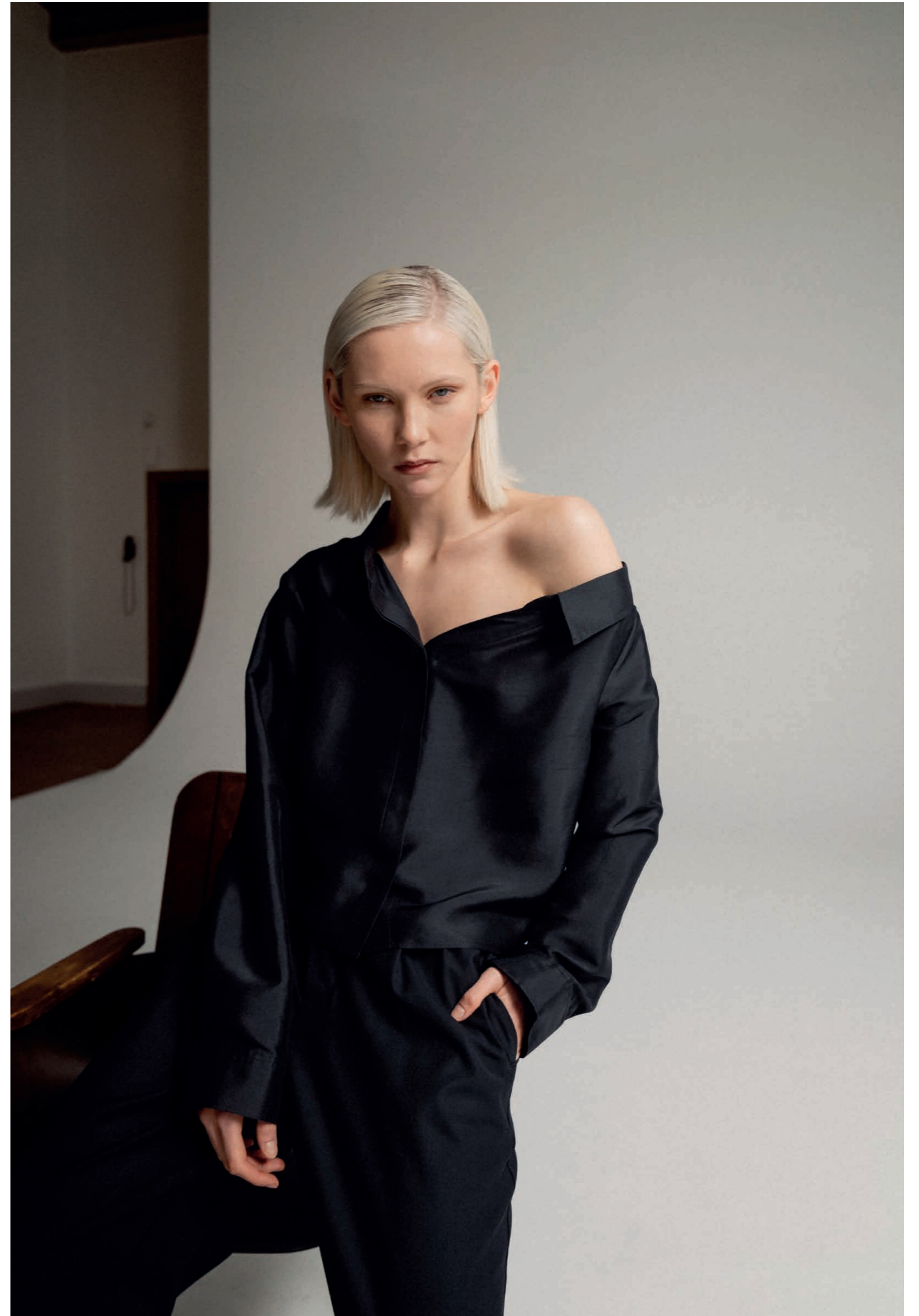
Mia off-shoulder silk shirt black, Mel wool trousers black