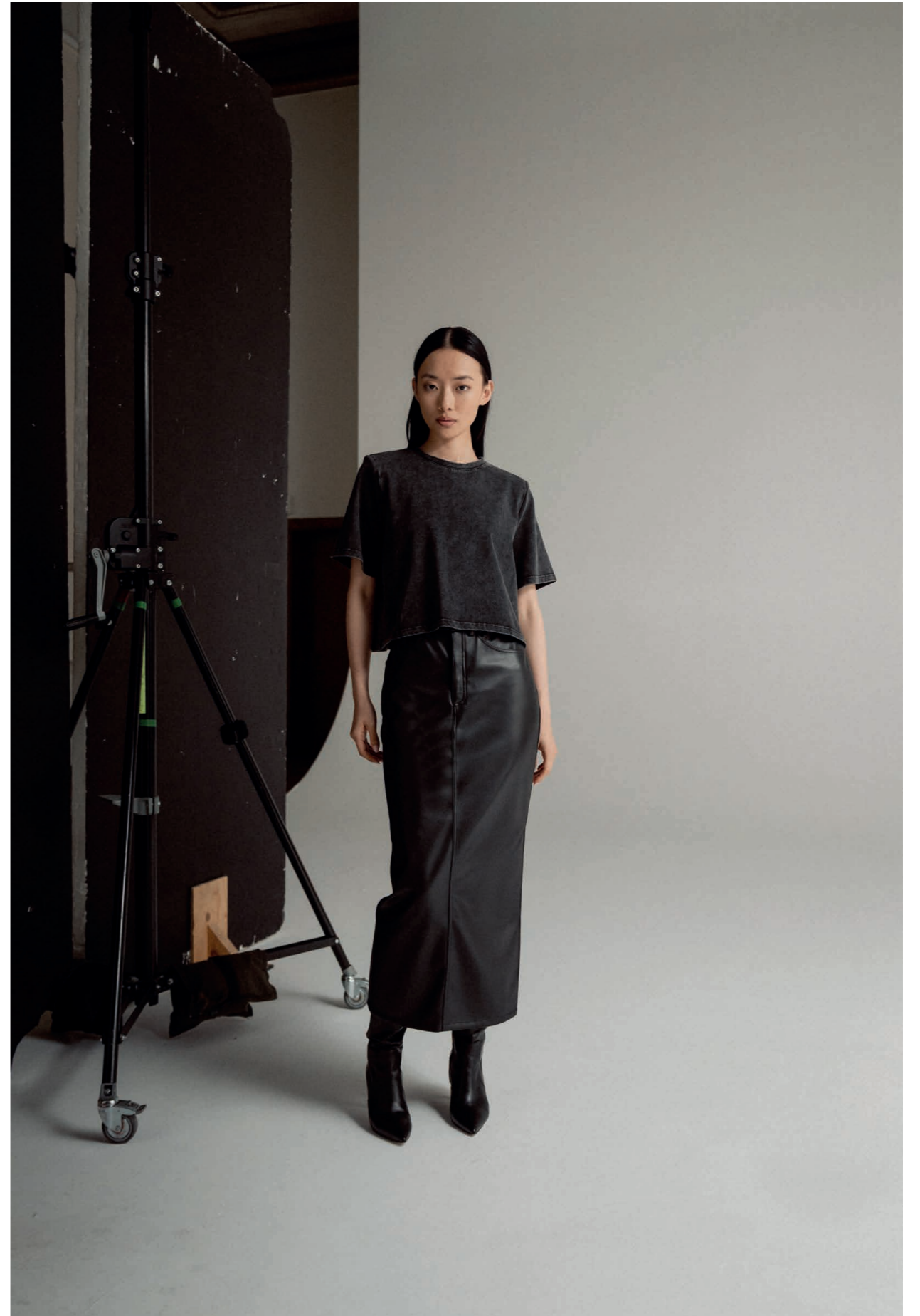
Okaya cropped tee washed black, Mika PU leather skirt black