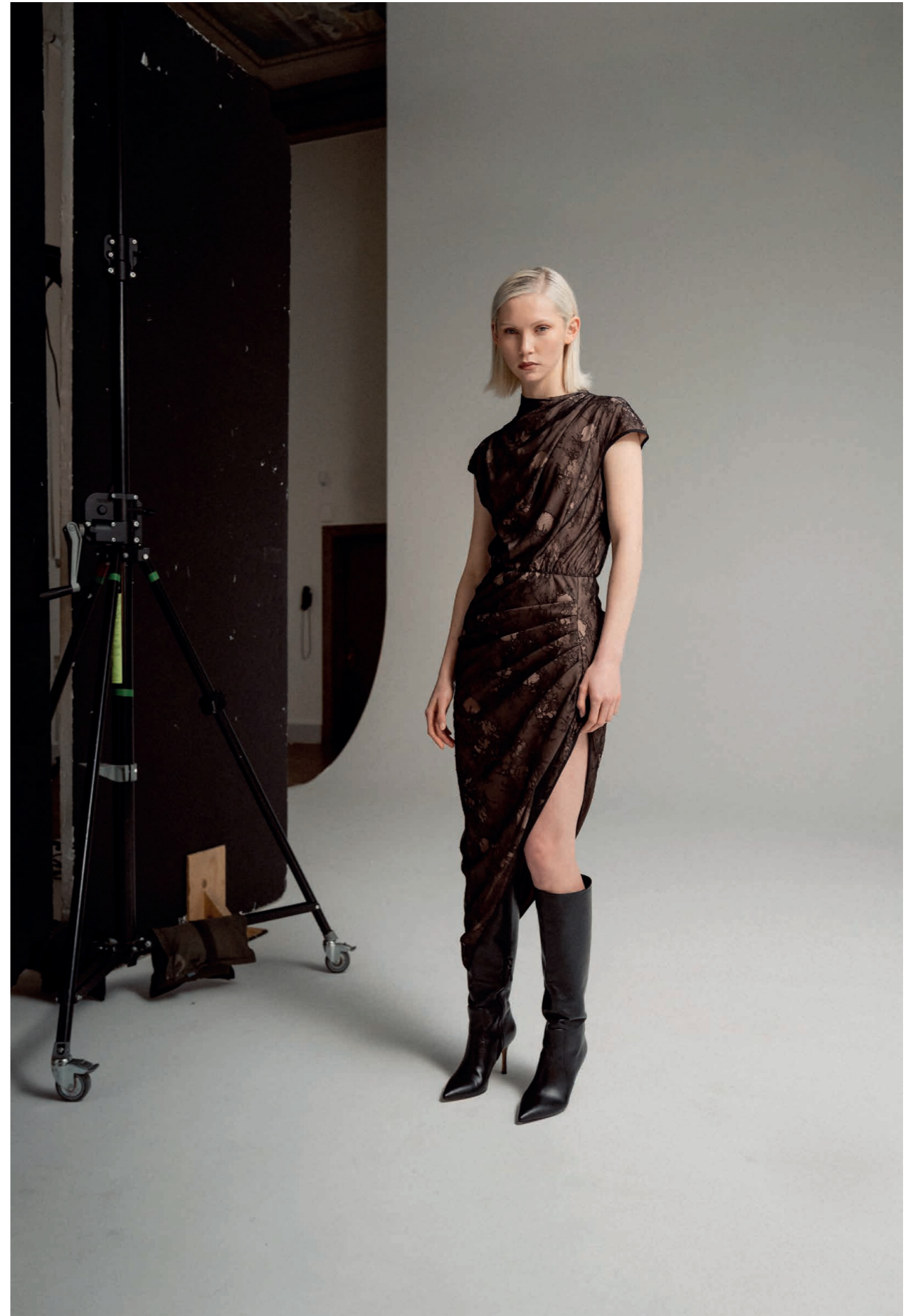
Lima lace dress black