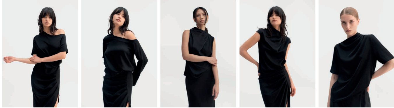
Chima silk blouse Chiney silk blouse Lima silk tank Lima silk top Lima silk tee