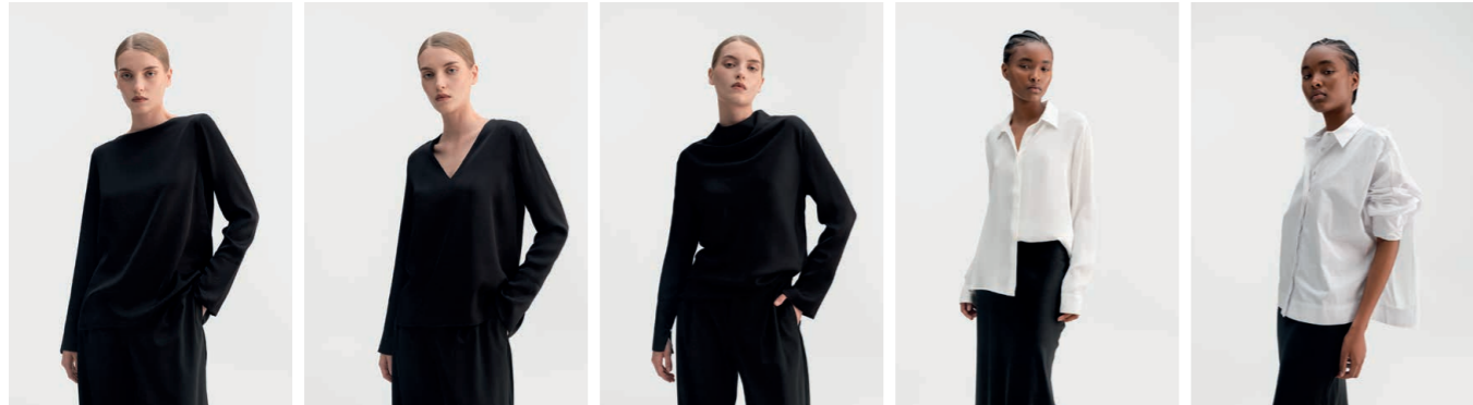
Kelly silk blouse Kelly v-neck silk blouse Ayumi silk blouse Mia silk shirt Gigi shirt