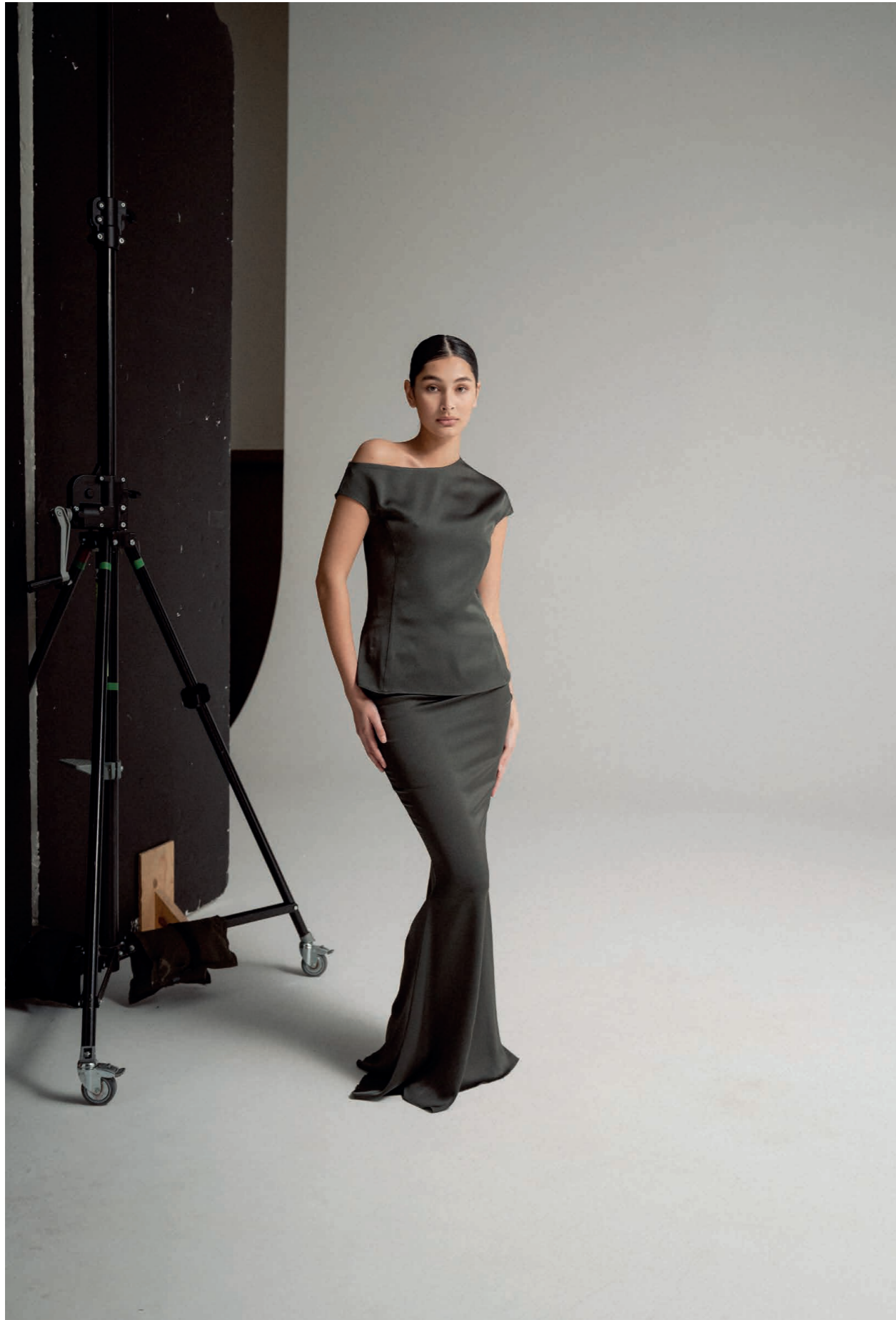
Chika top wood, Myra skirt wood