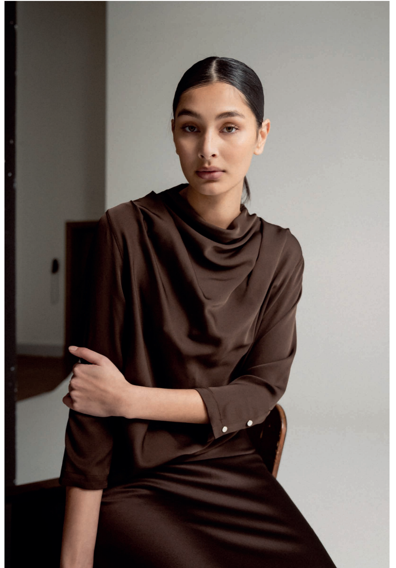
Minou silk blouse dark brown, Hana satin silk skirt dark brown