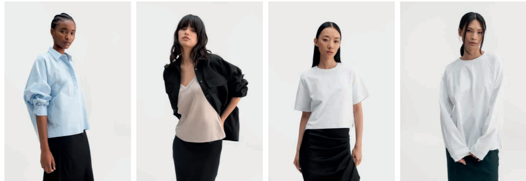
Gigi oxford shirt Kaia over shirt Okaya cropped tee Thelma LS tee