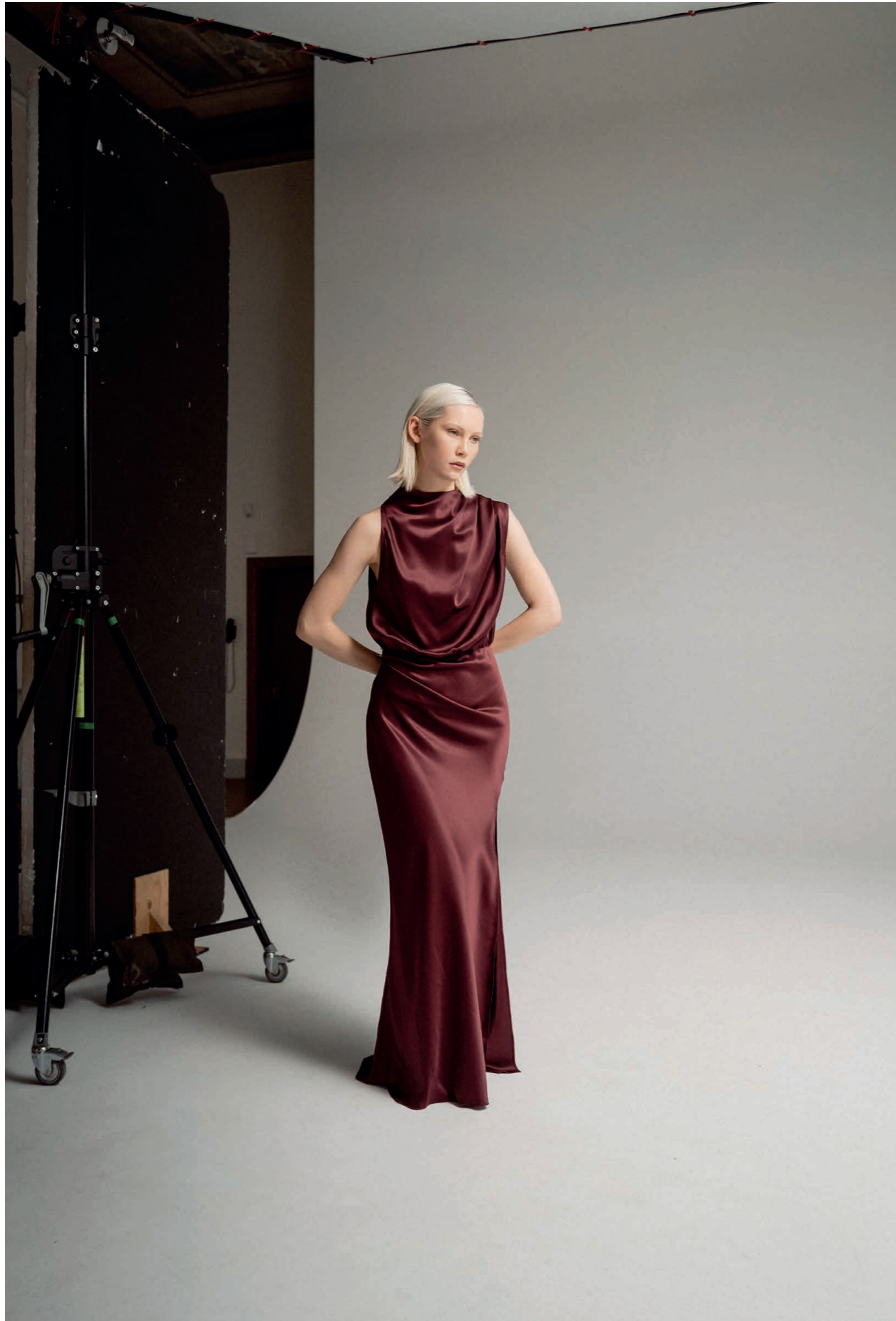
Eli satin dress burgundy