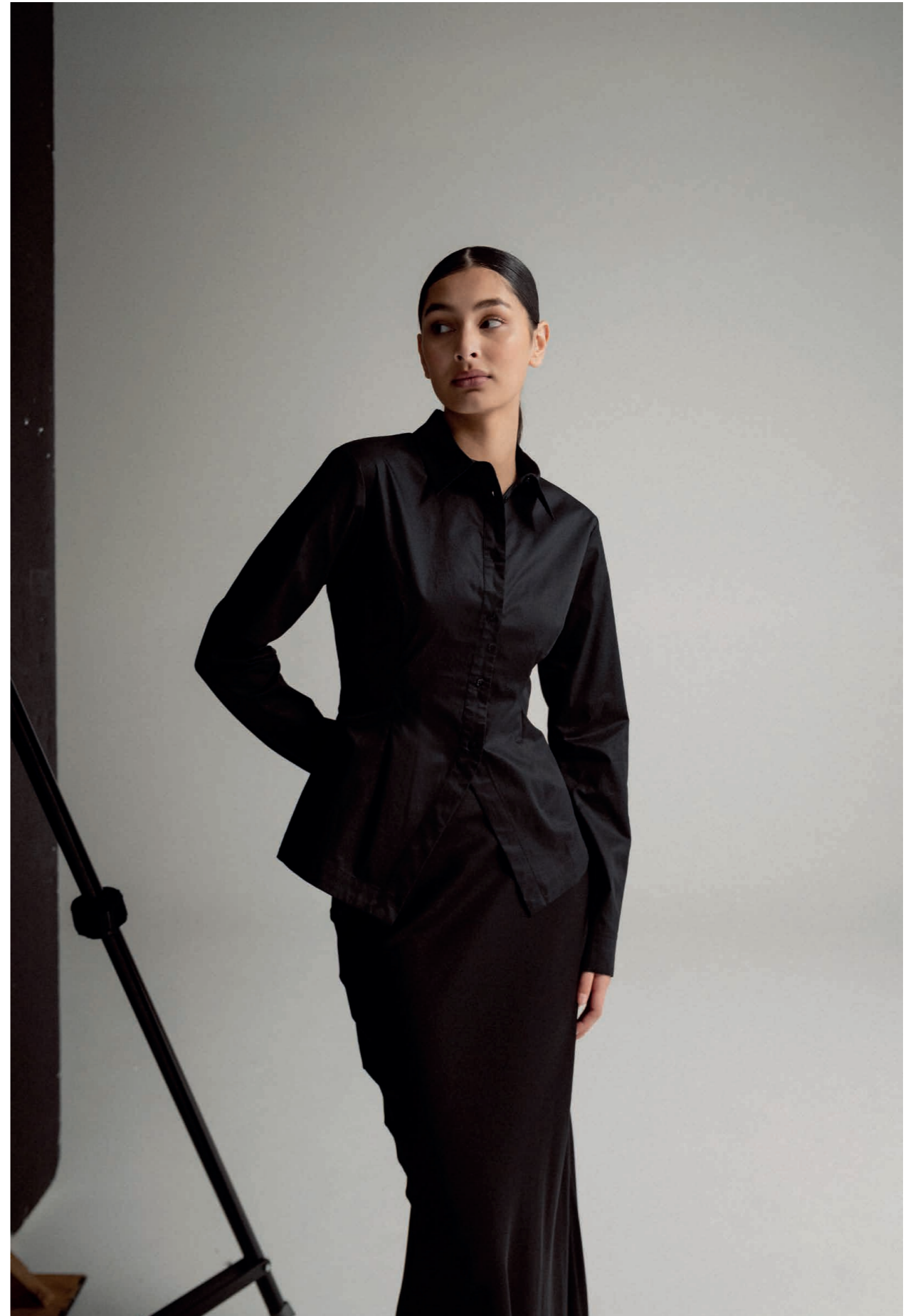
Leia shirt black