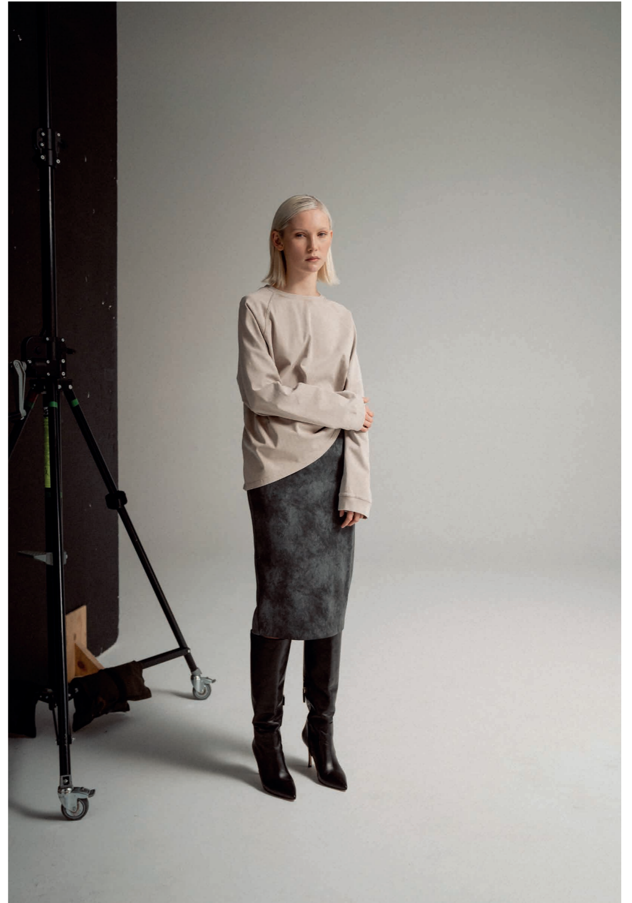
Thelma LS tee washed greige, Alila PU leather skirt dark grey