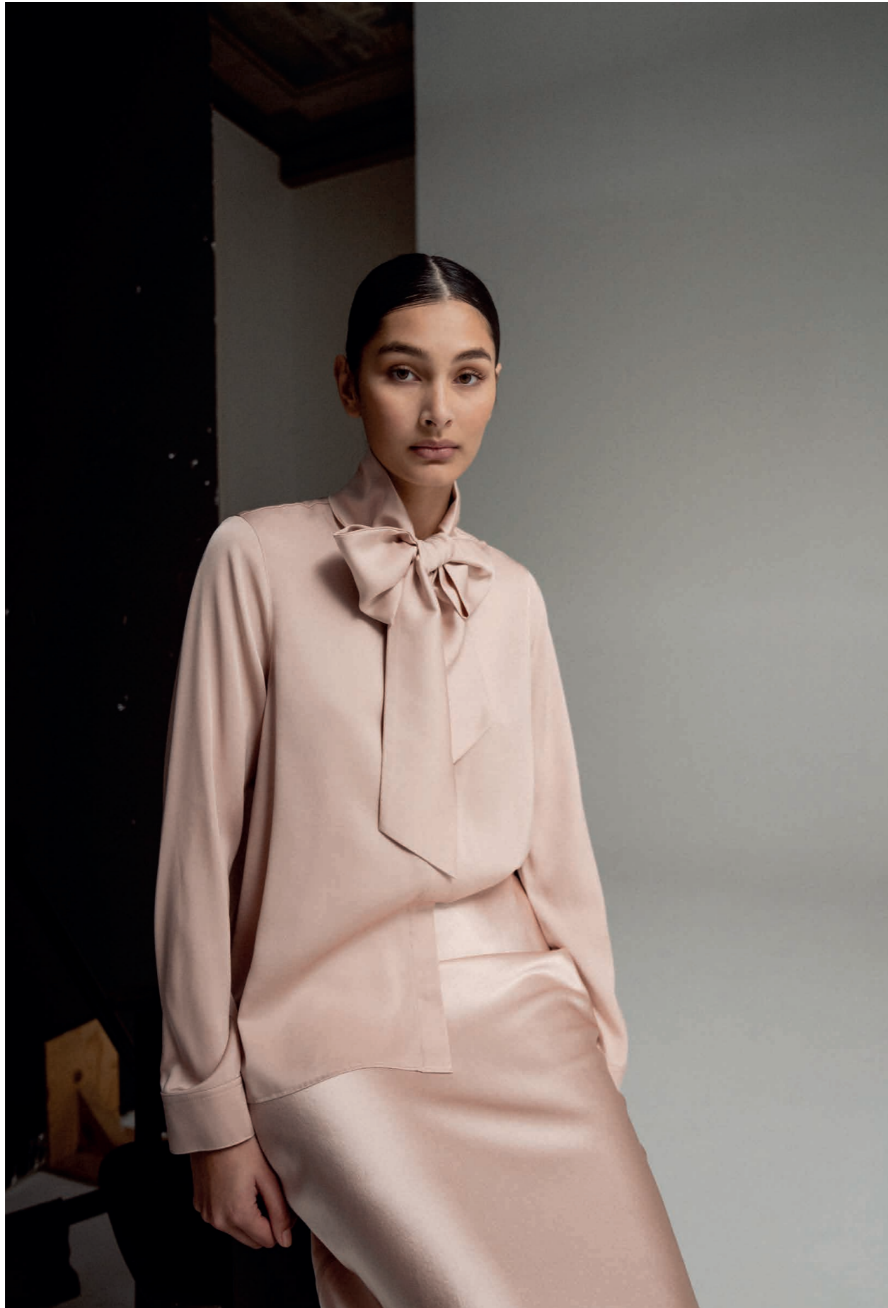
Miki silk blouse dusty pink, Hana satin silk skirt dusty pink