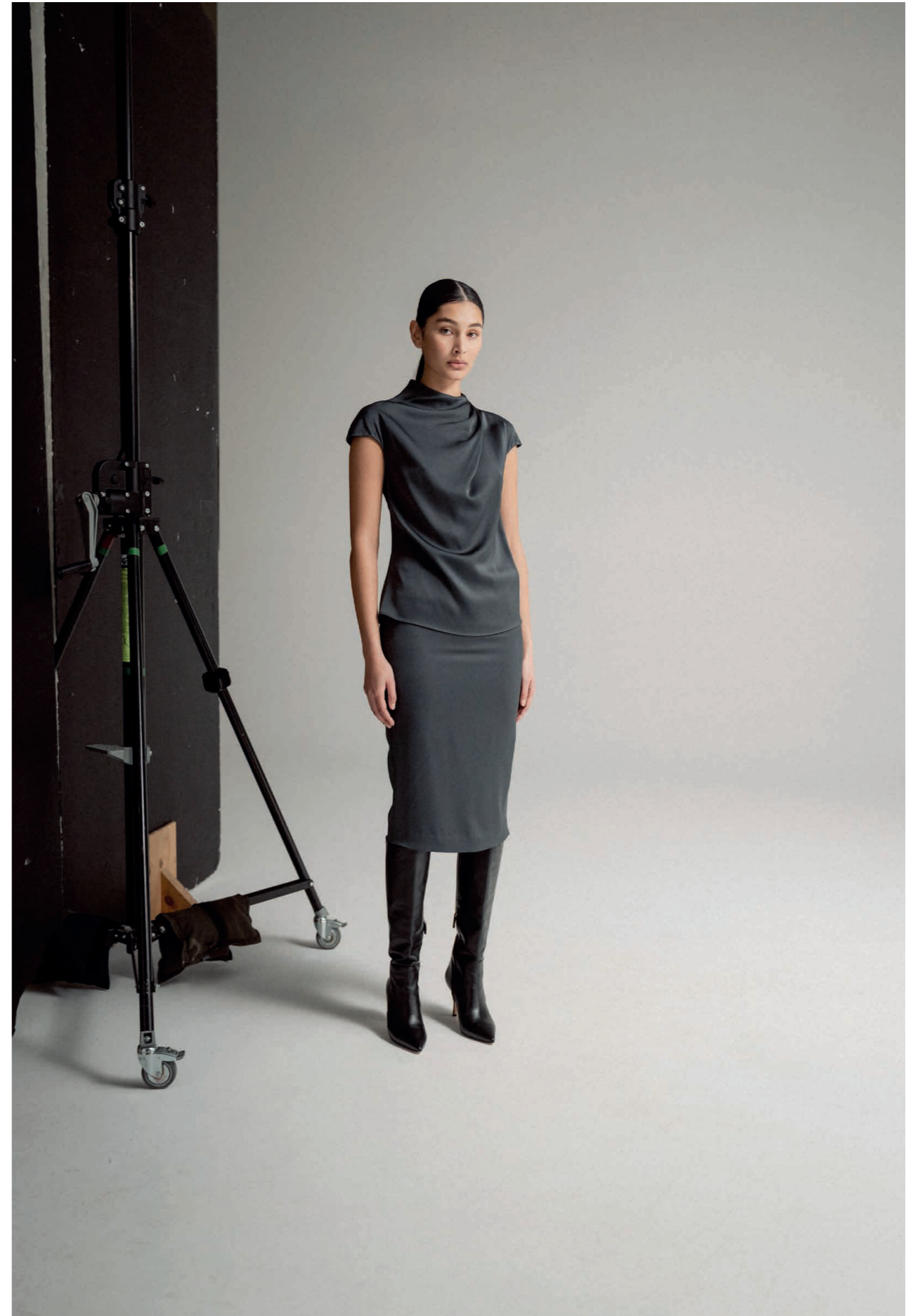
Lima top dark grey, Alila skirt dark grey