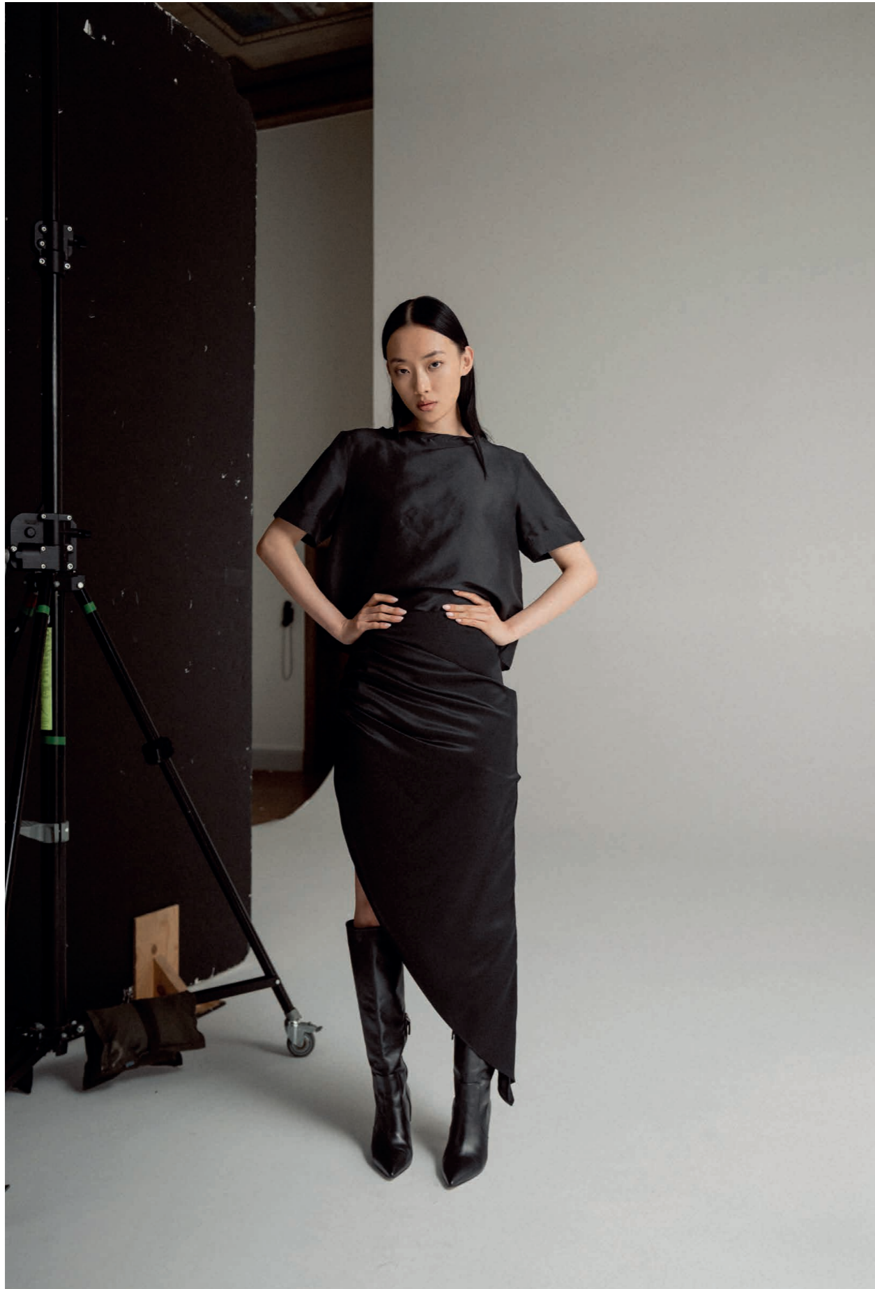
Loni silk tee black, Eden satin skirt black