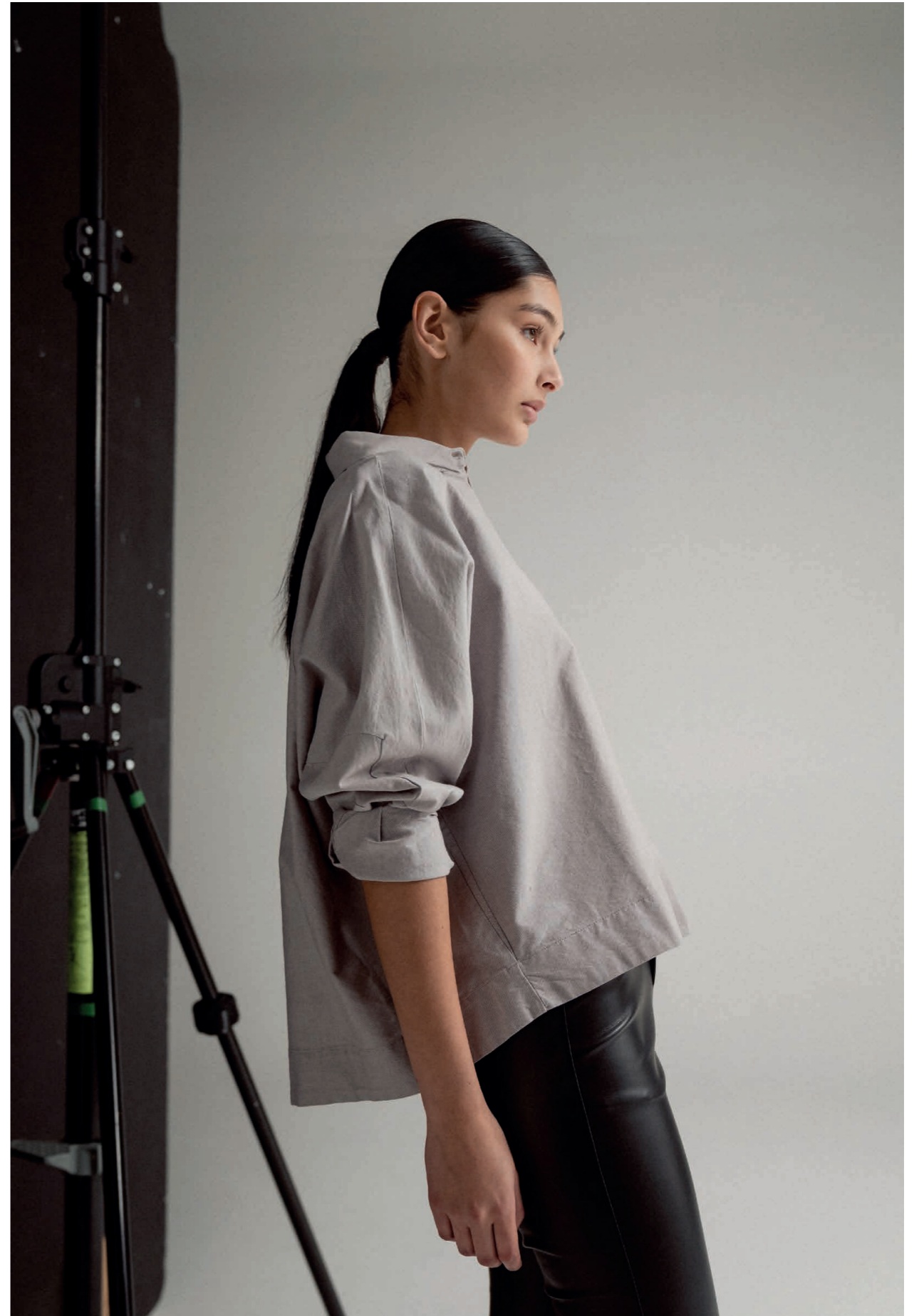
Gigi oxford shirt light brown