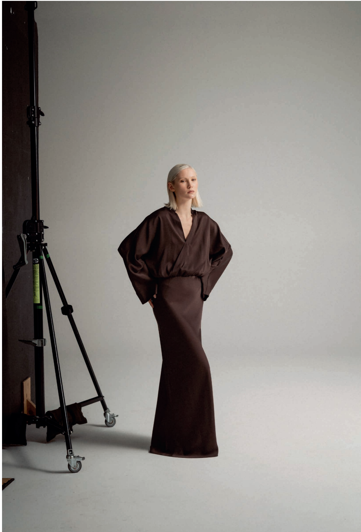
Niva dress dark brown