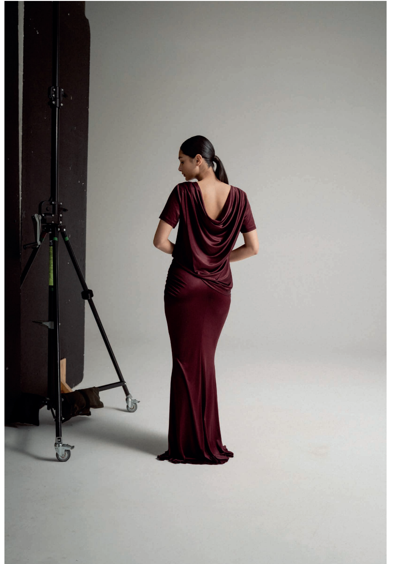
Yuni jersey tee burgundy, Myra jersey skirt burgundy