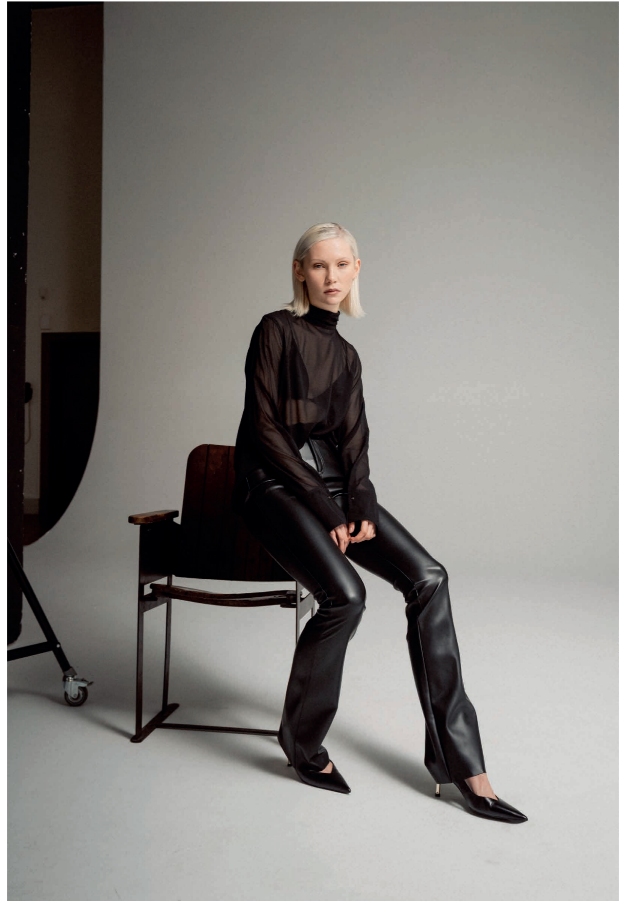
Rika see-through silk blouse black, Aiko PU leather trousers black