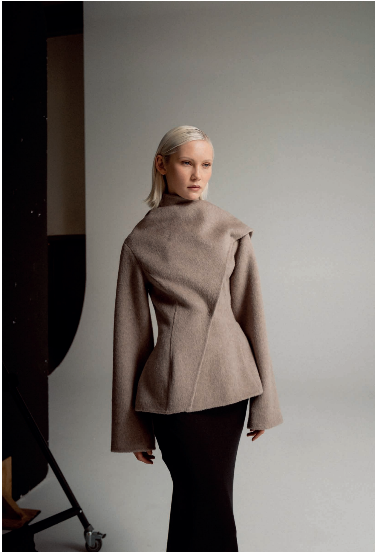
Leni wool blazer light brown