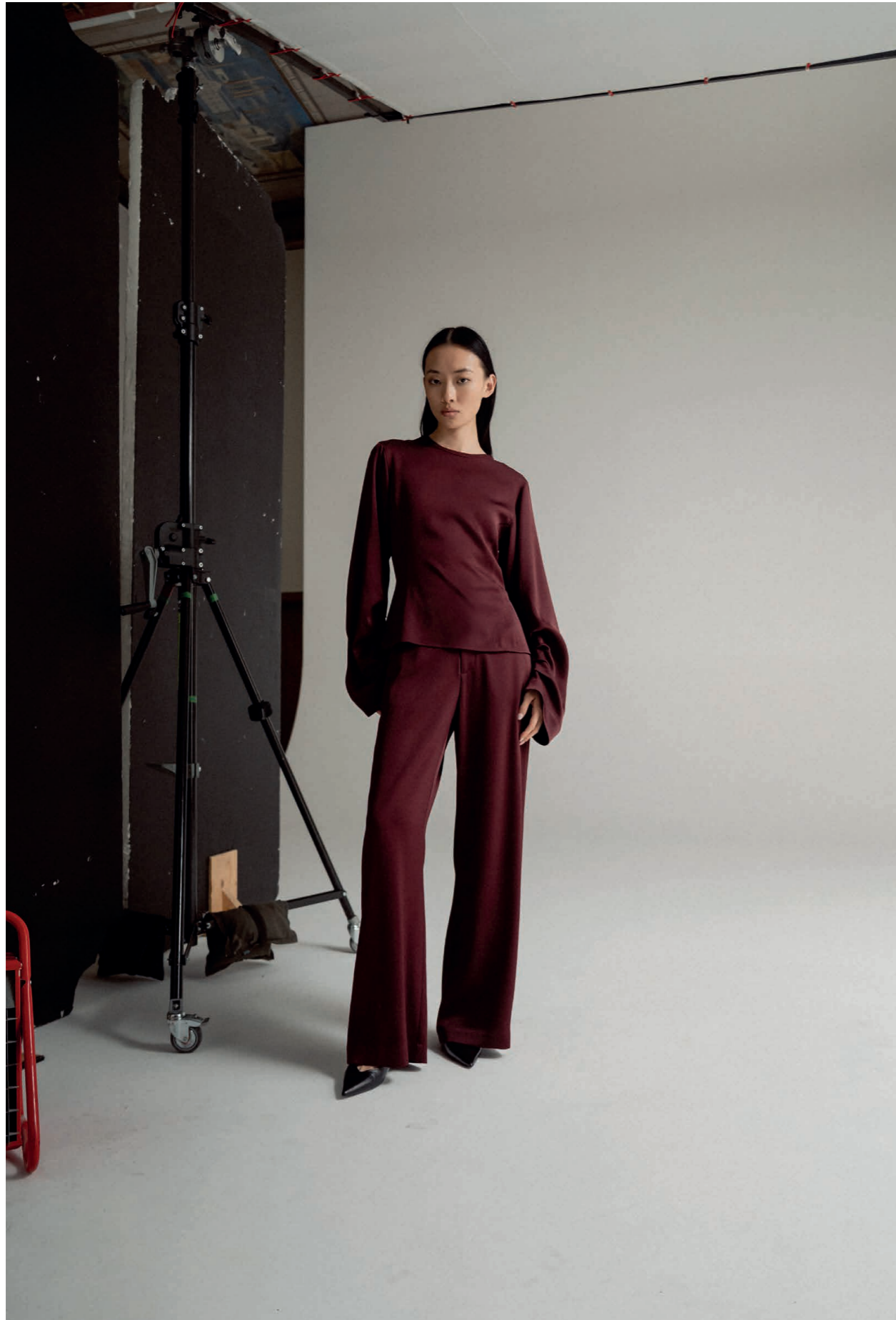
Dara blouse burgundy, Mila trousers burgundy