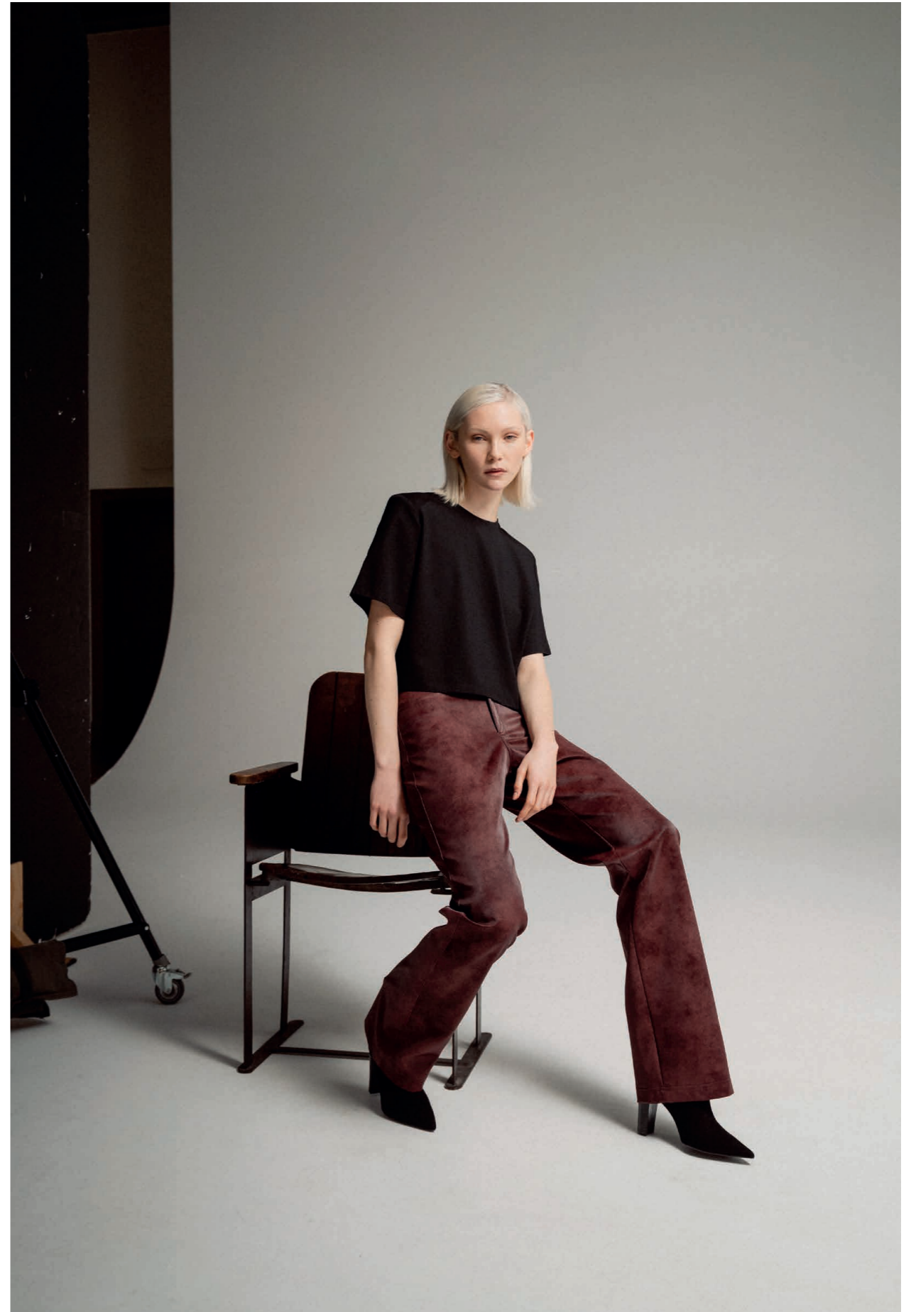
Okaya cropped tee black, Aina PU leather trousers burgundy