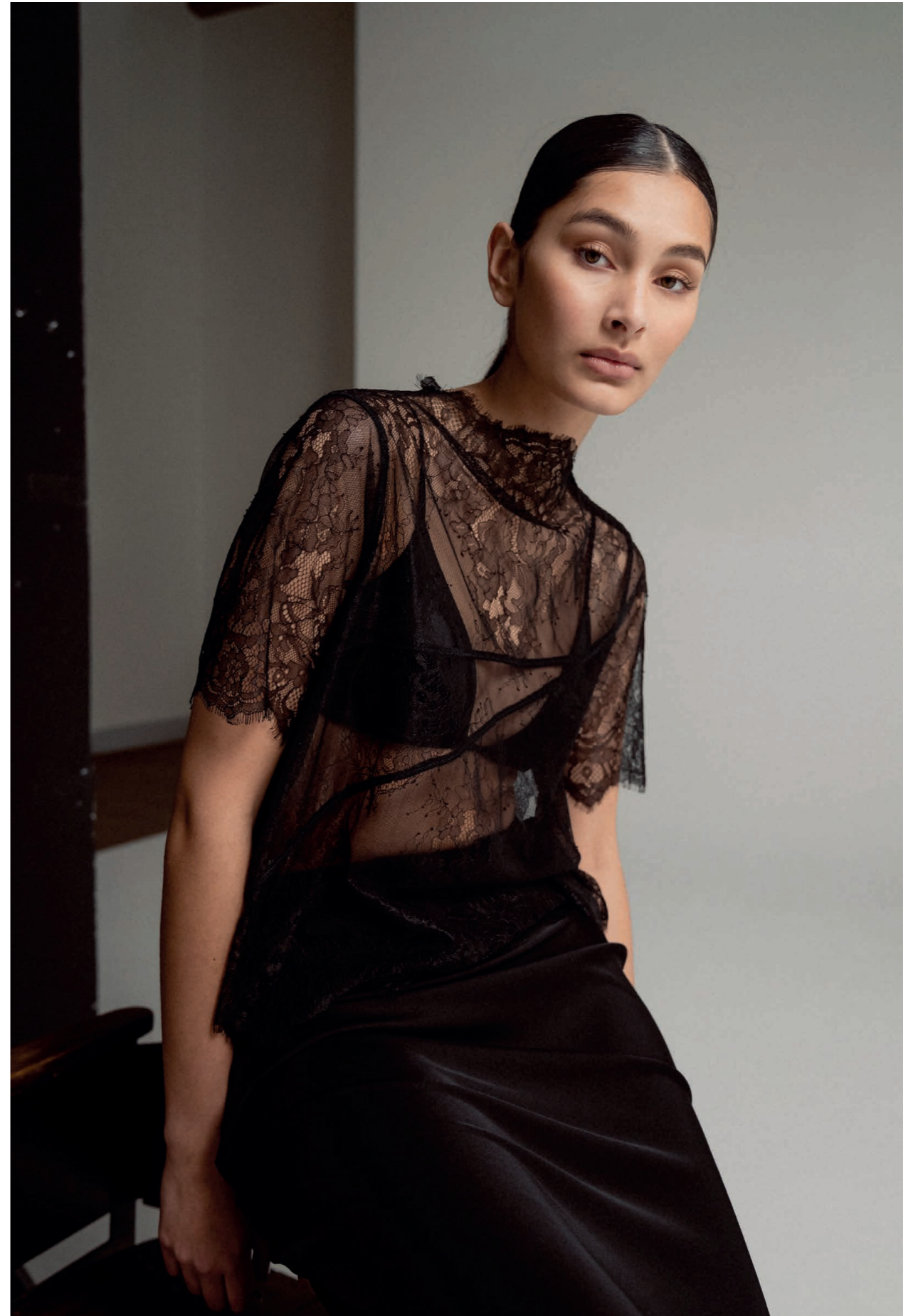
Edina lace tee black