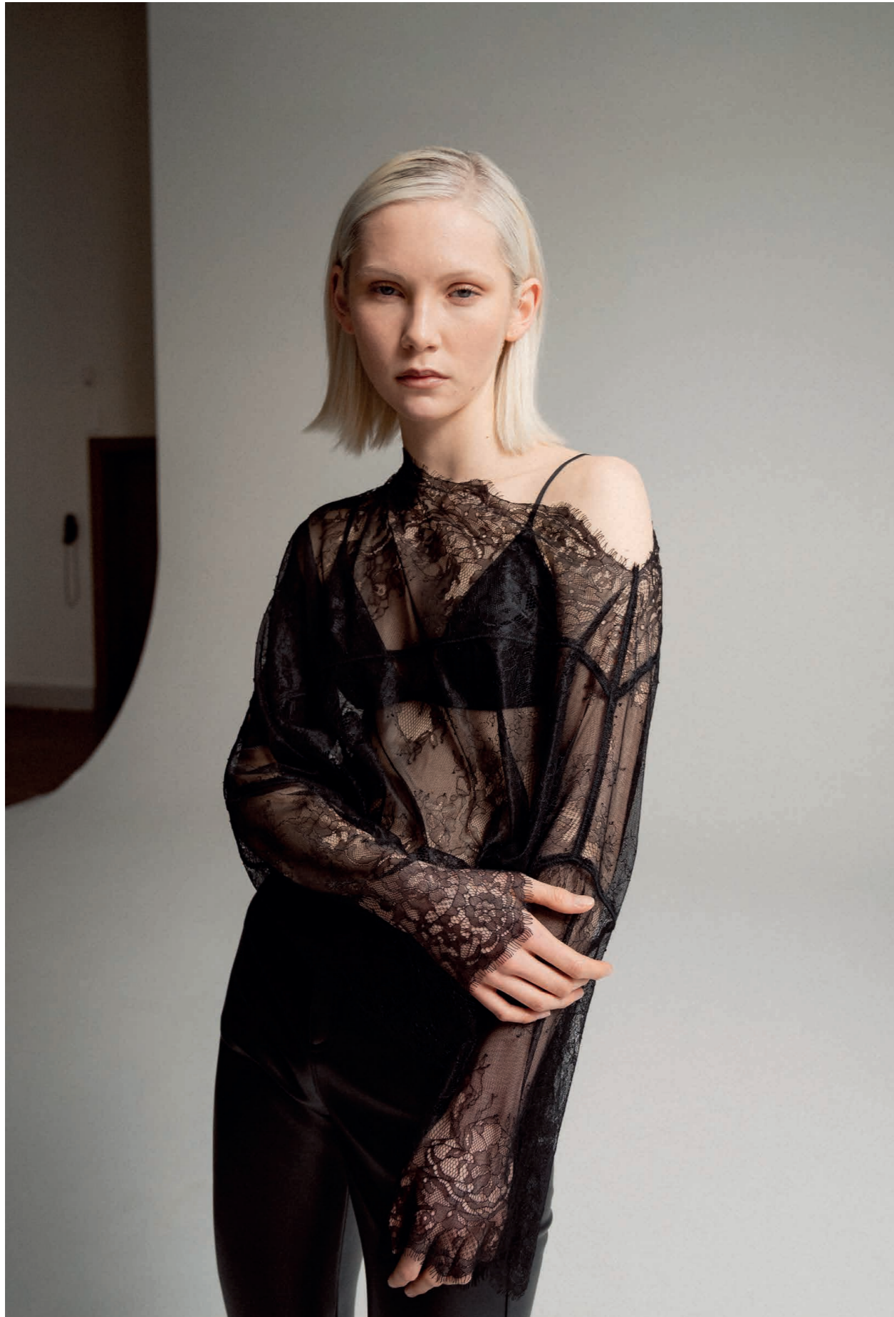
Alma lace blouse black