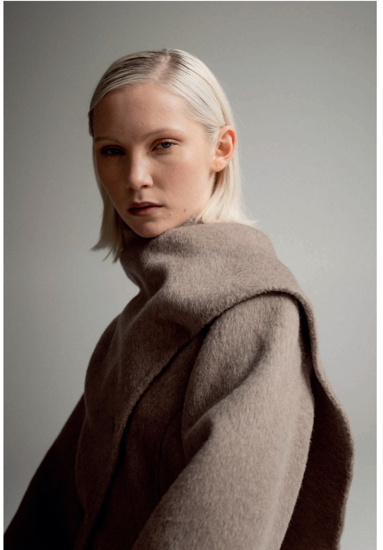
Leni wool blazer light brown