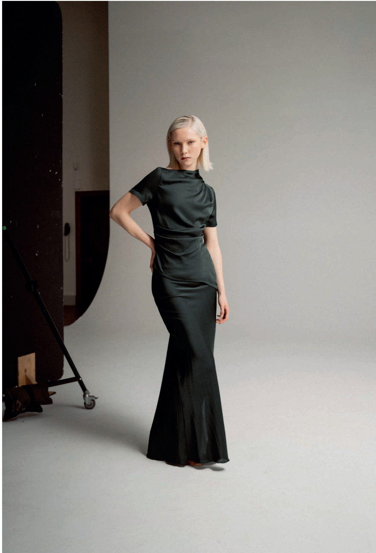
Lizi silk tee deep forest, Hana long silk skirt deep forest