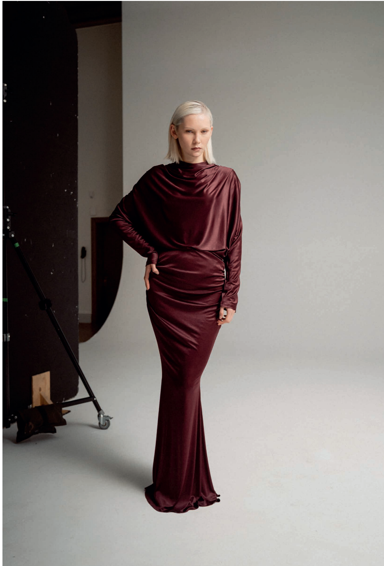
Milly jersey blouse burgundy, Myra jersey skirt burgundy