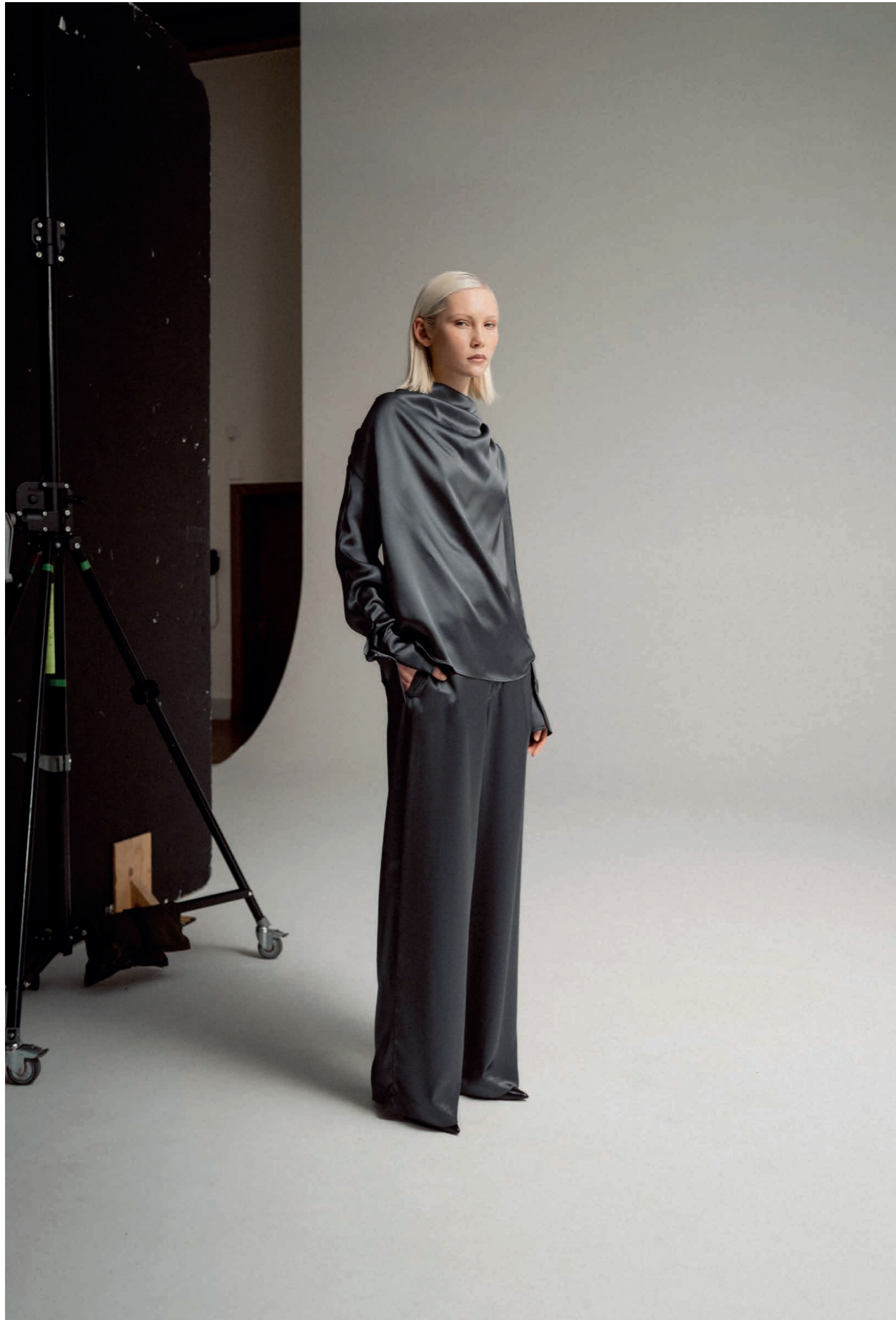
Miko satin blouse dark grey, Mila satin trousers dark grey