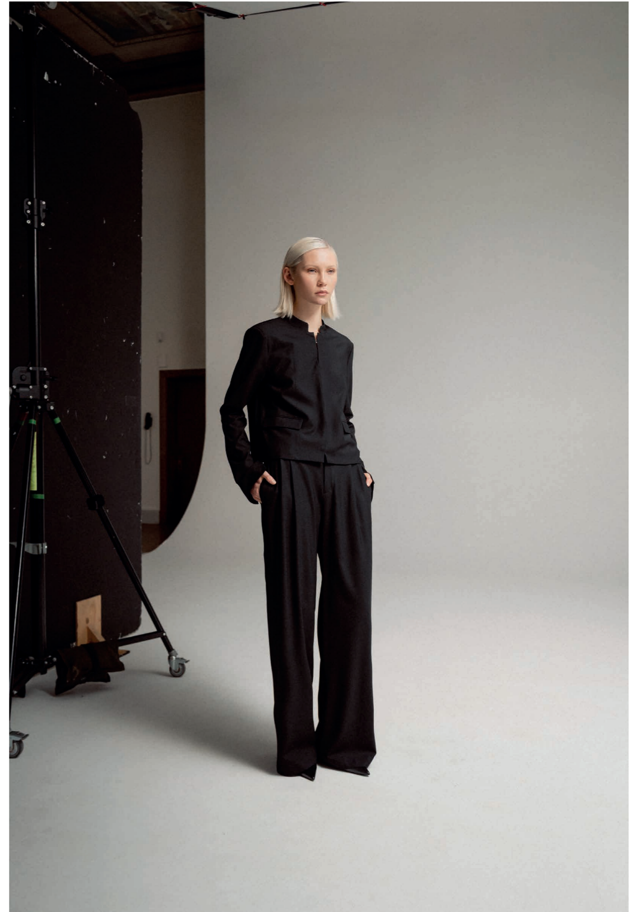
Liz wool blazer black, Mel wool trousers black