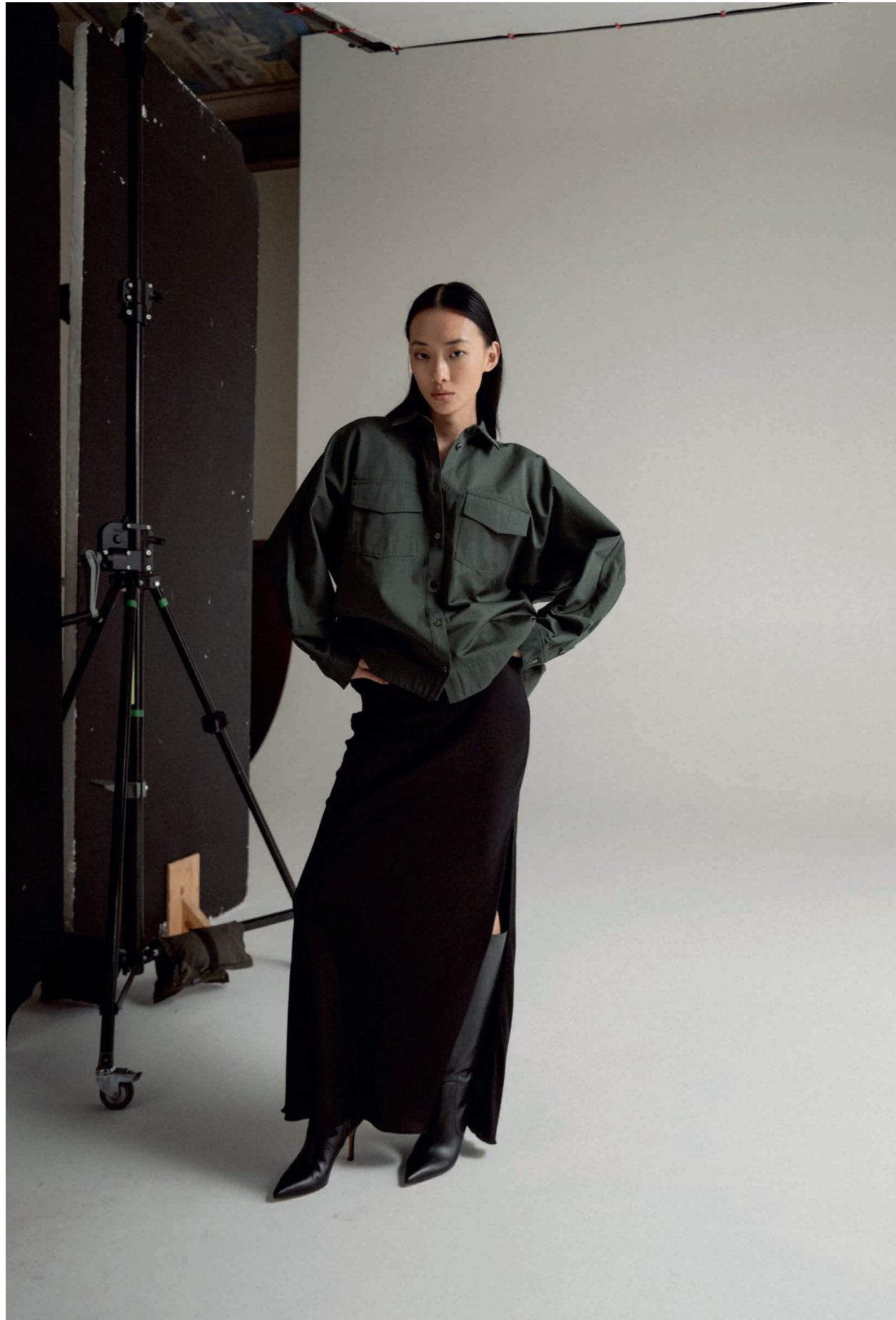
Kaia over shirt wood, Hana long silk skirt black