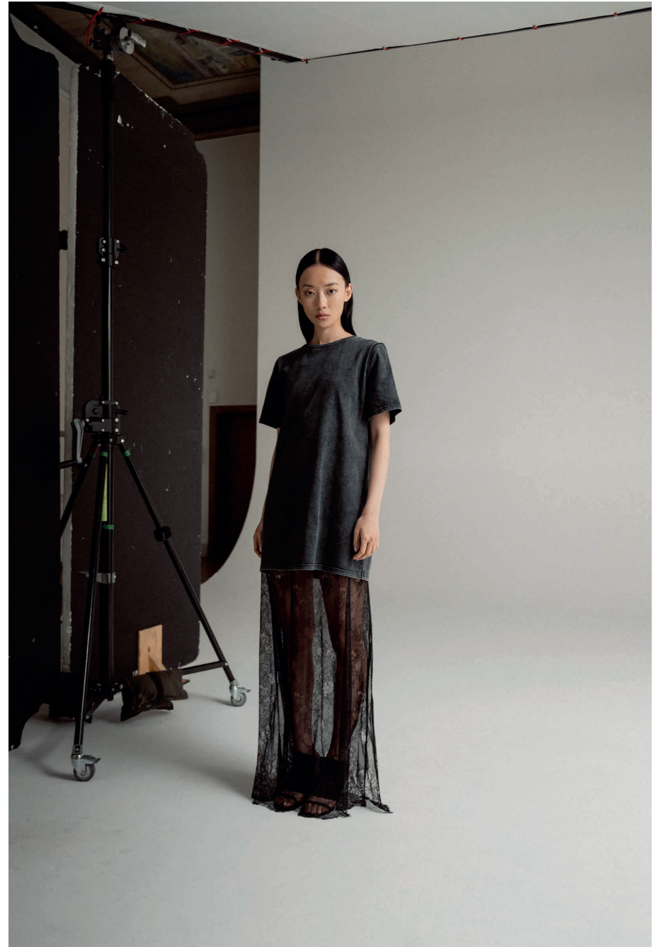
Oki long tee washed black, Hana long lace skirt black