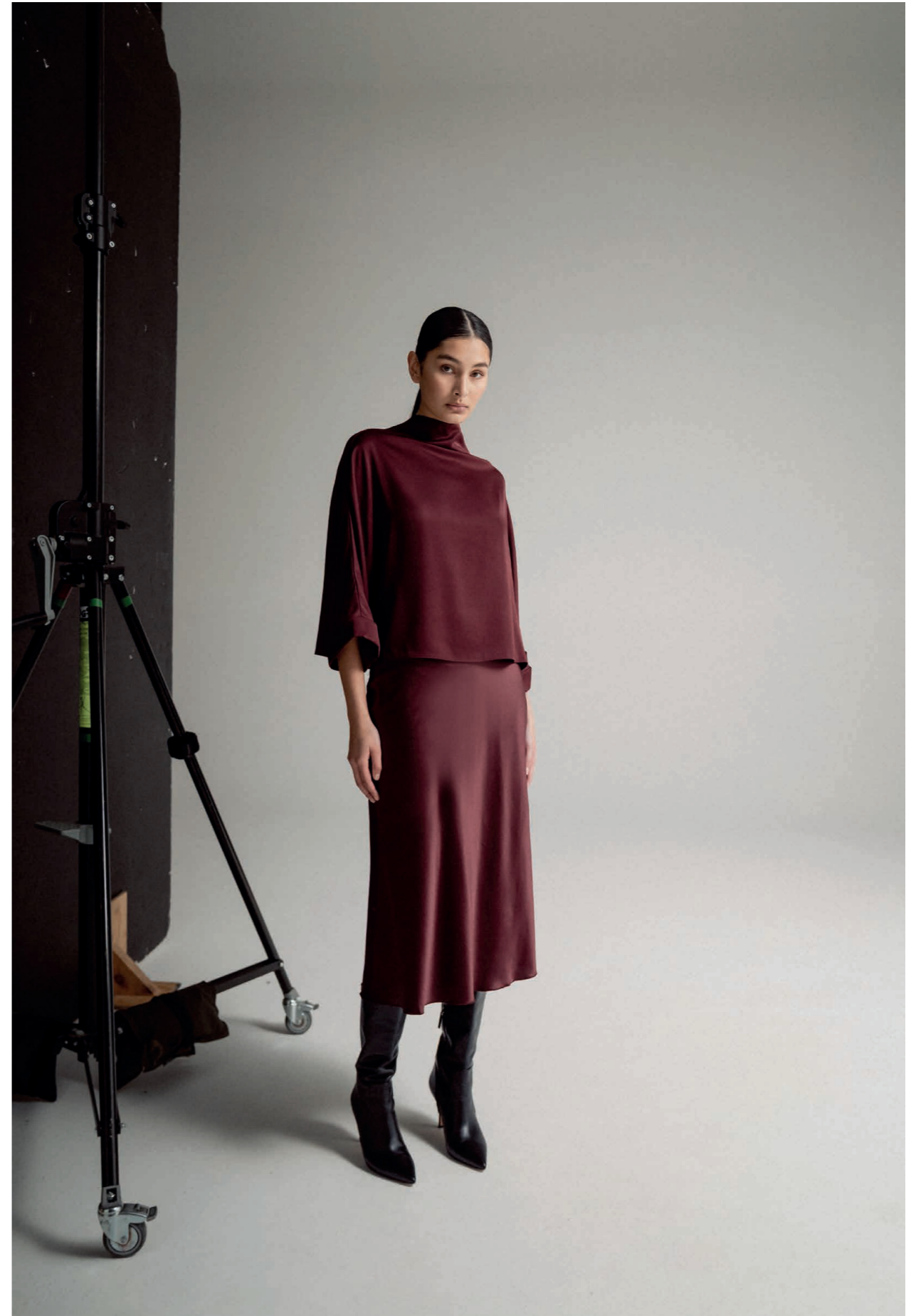
Thia silk tee burgundy, Hana satin silk skirt burgundy