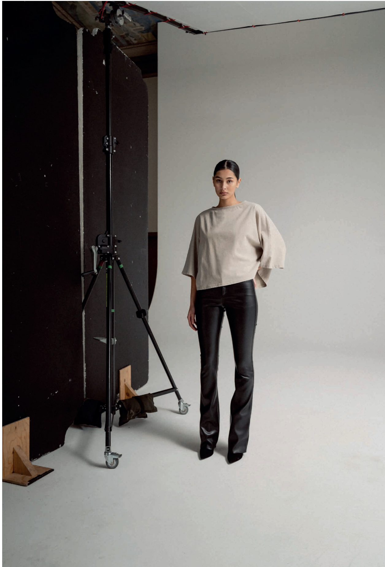
Thea jersey tee washed greige, Aiko PU leather trousers black