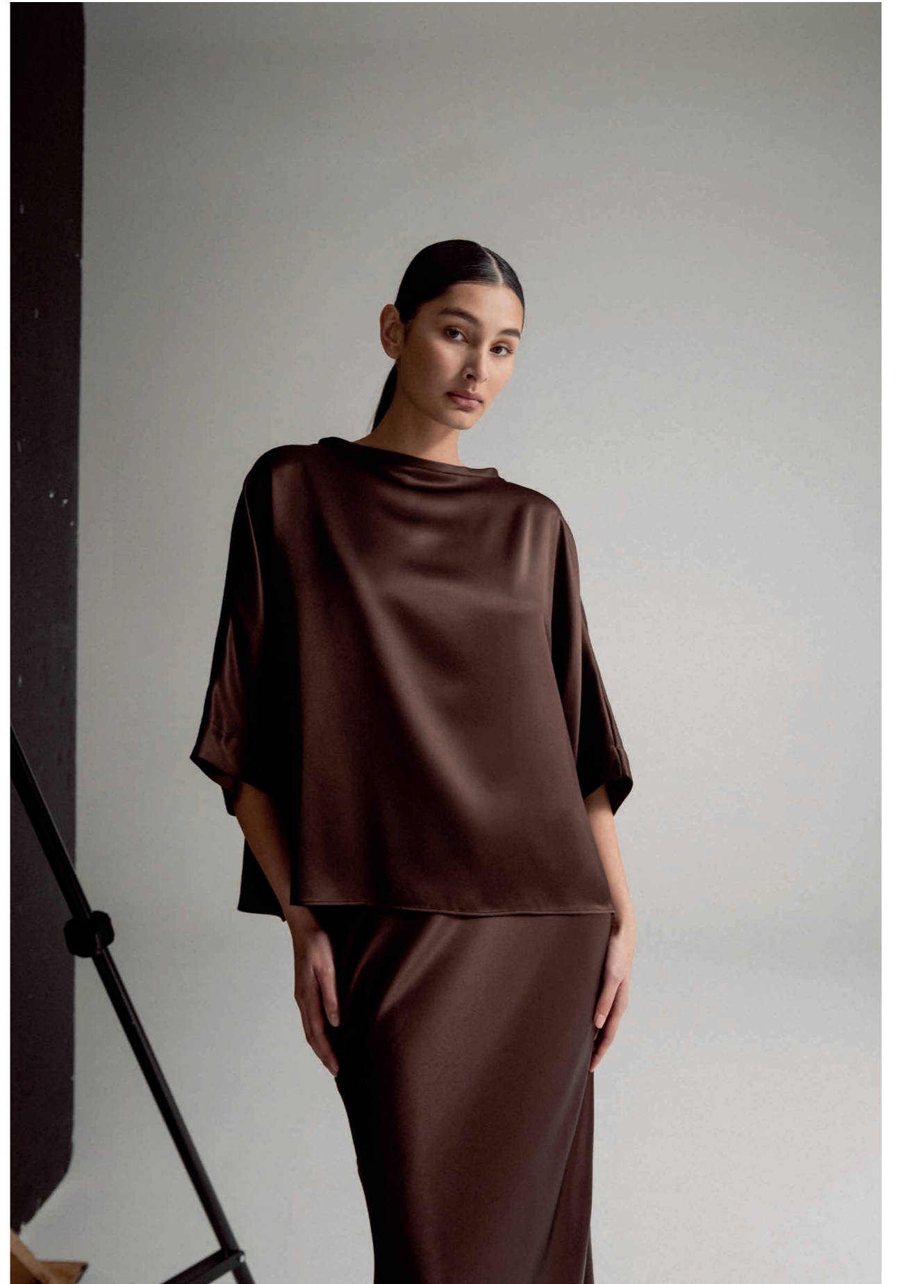
Tori satin tee dark brown, Hana long logo satin skirt dark brown