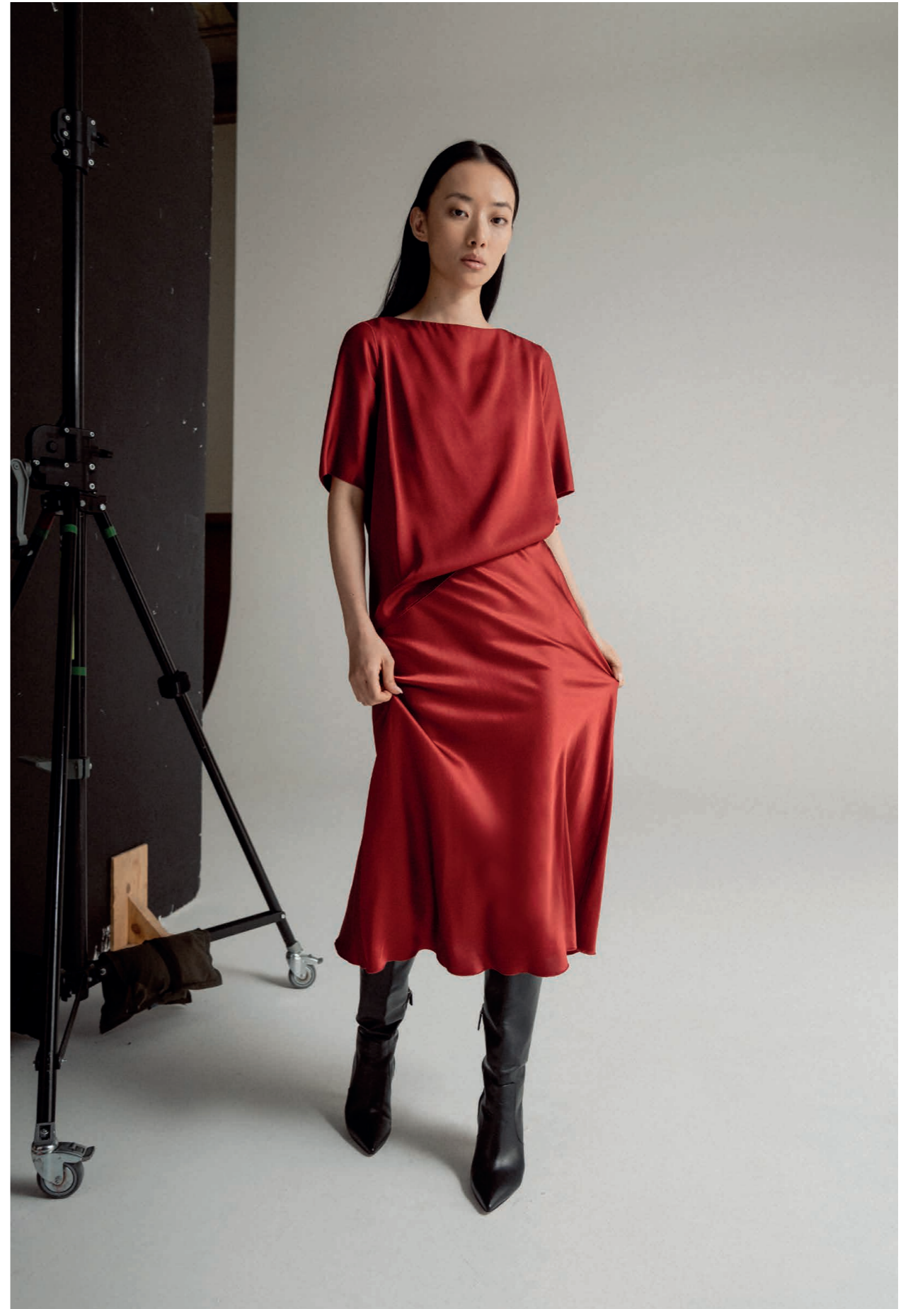
Yoli silk blouse dark red, Hana satin silk skirt dark red