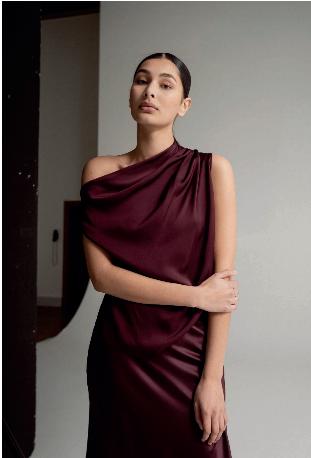
Lana silk tank burgundy, Hana satin silk skirt burgundy