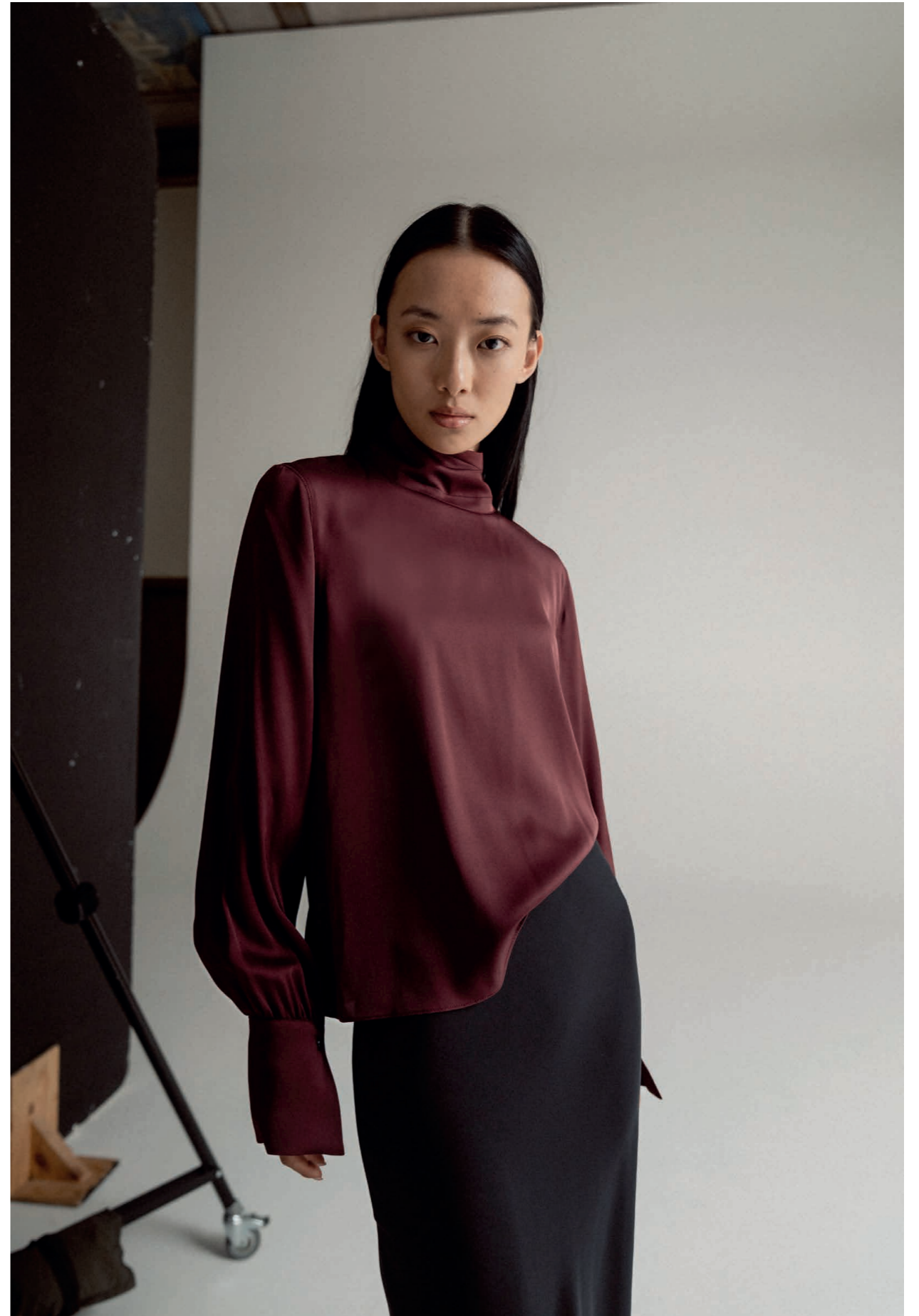
Luna silk blouse burgundy