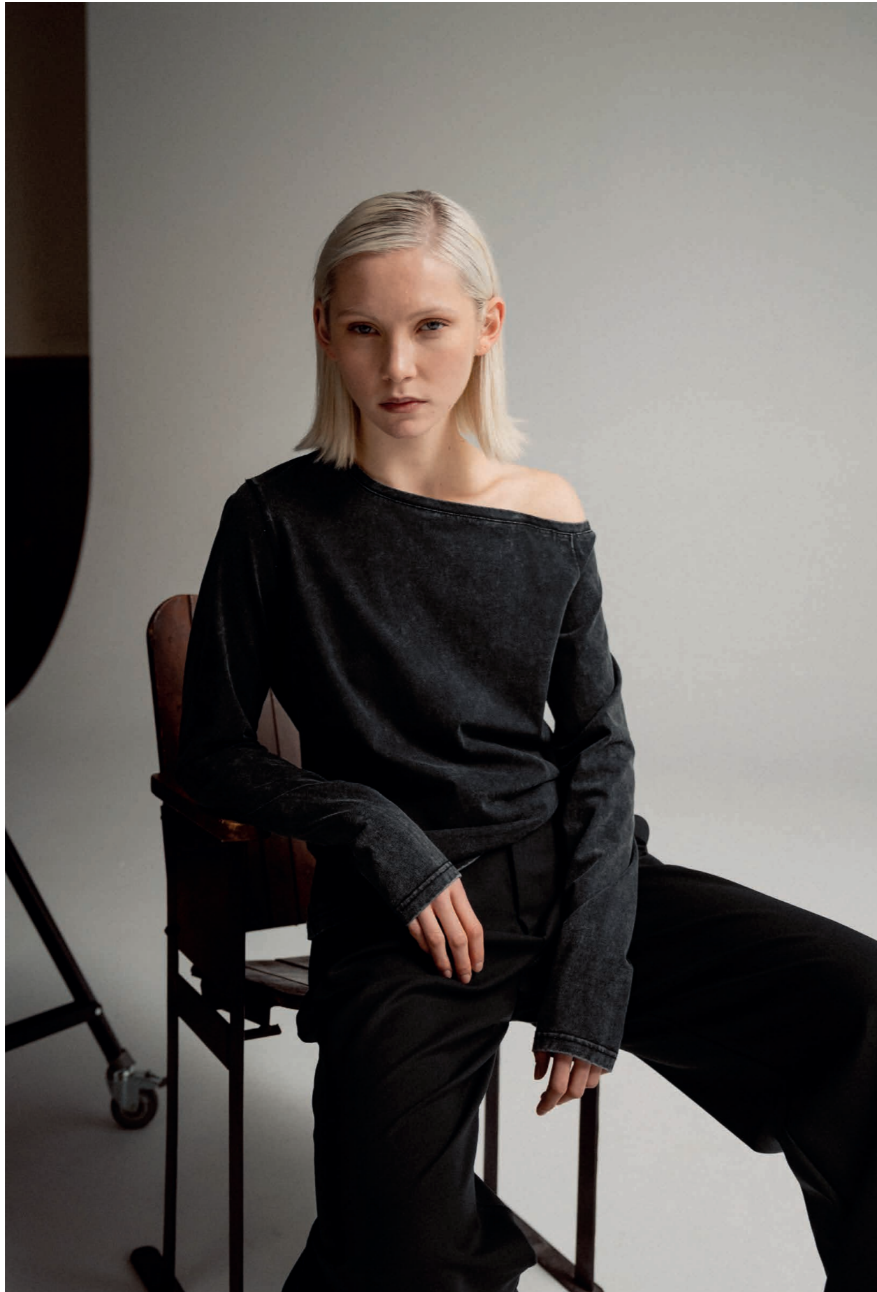
Chiney jersey blouse washed black, Mel wool trousers black