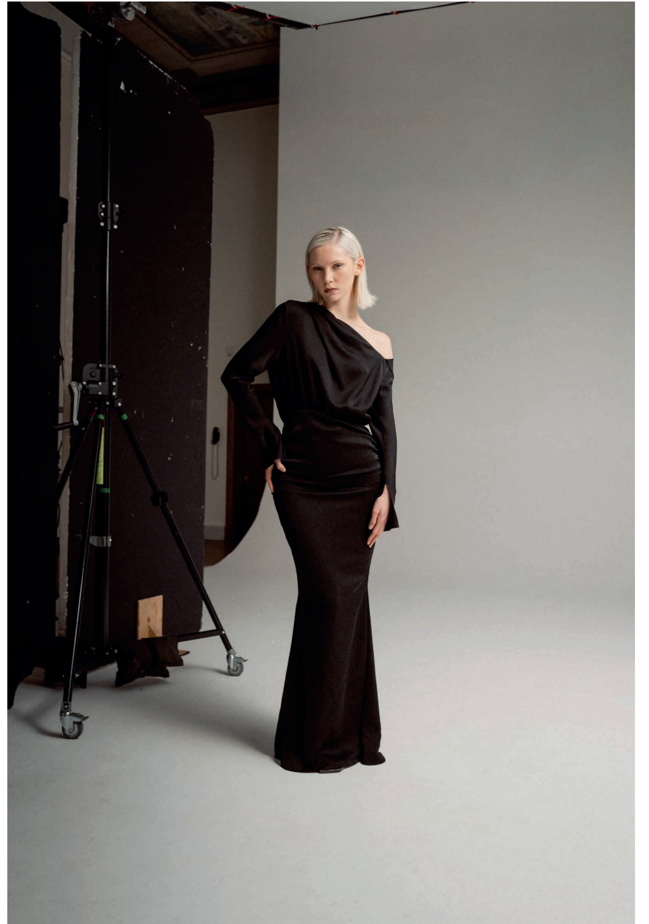
Cora dress black