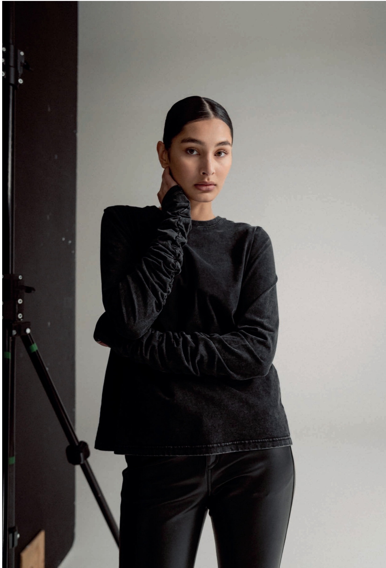
Ona LS tee washed black