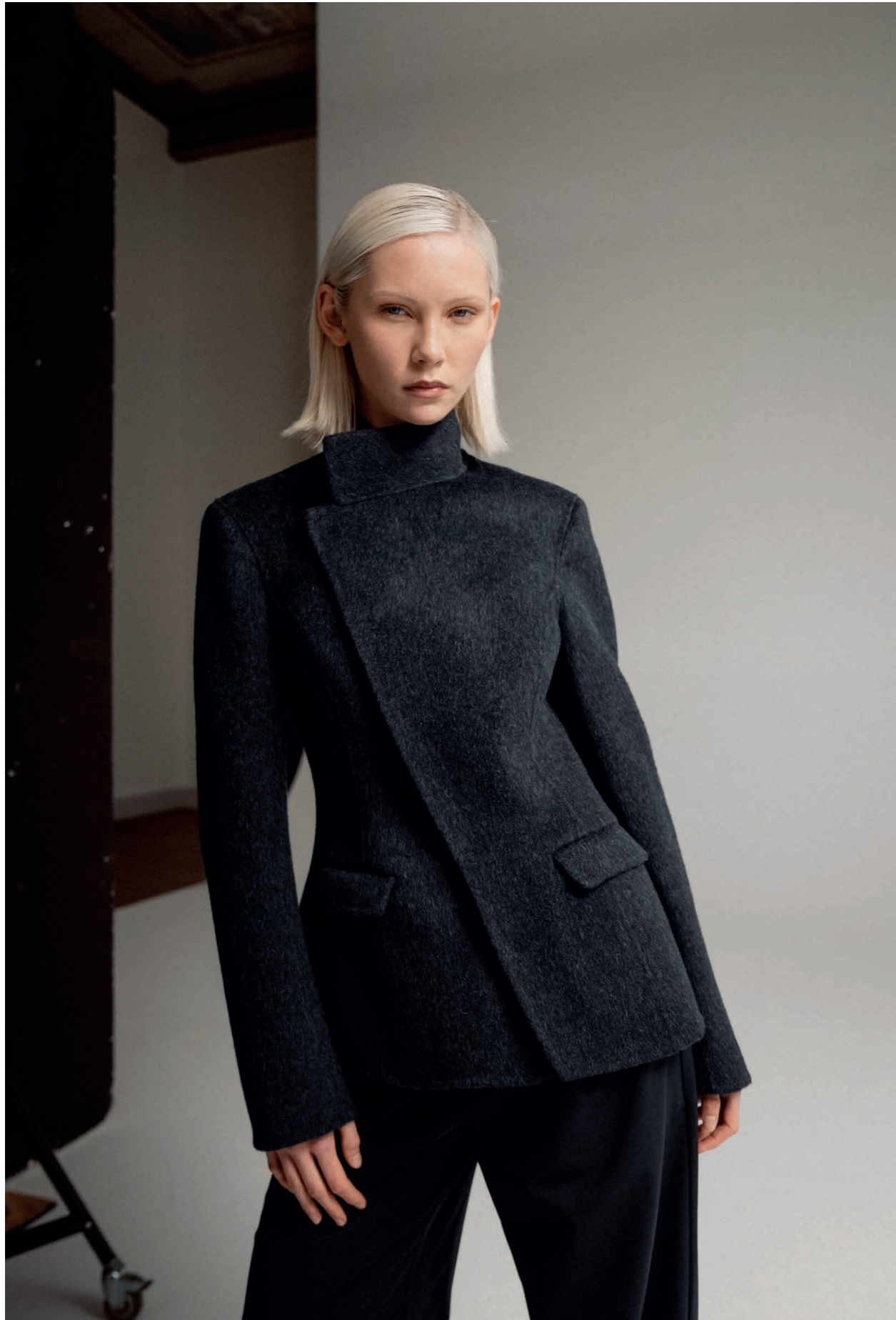
Leia wool blazer black