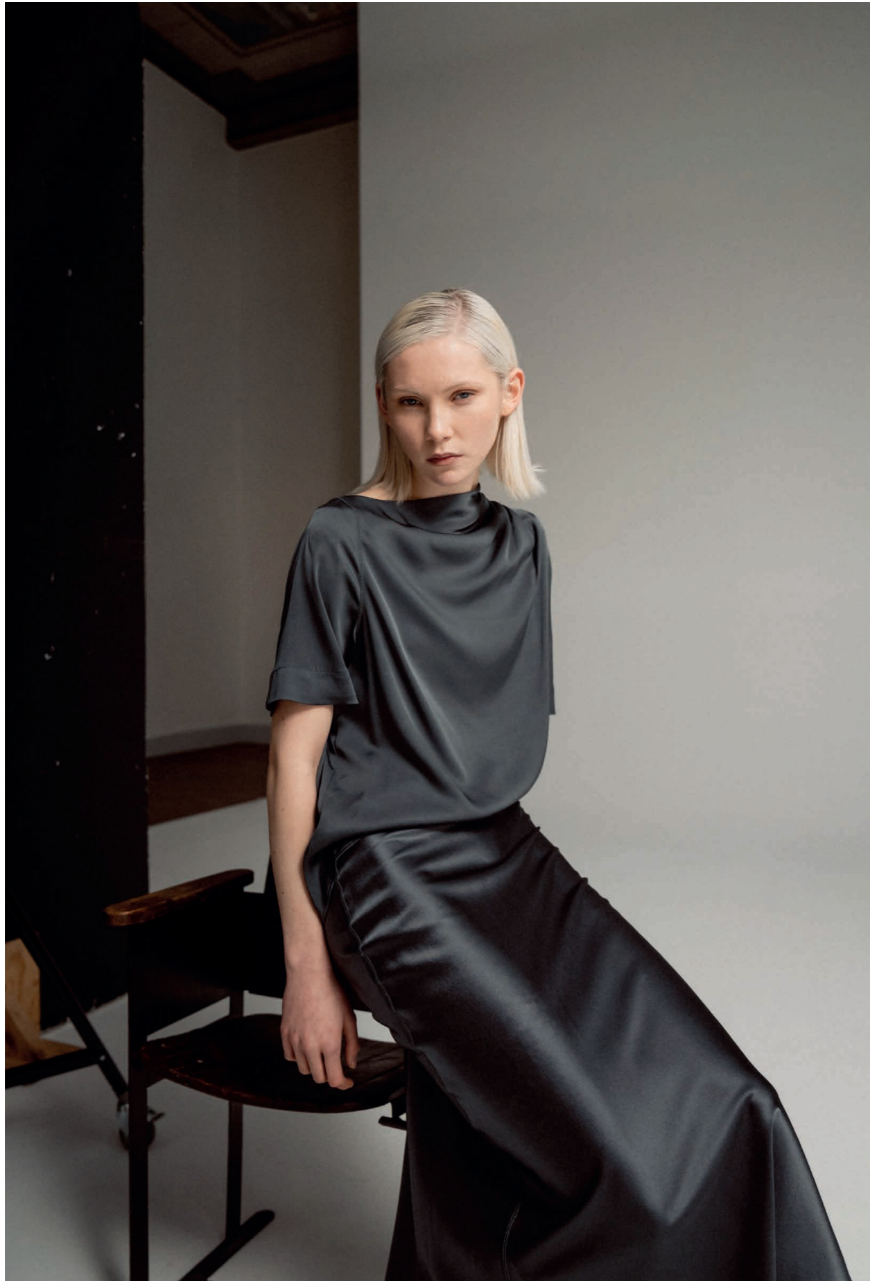
Lima silk tee dark grey, Hana satin silk skirt dark grey