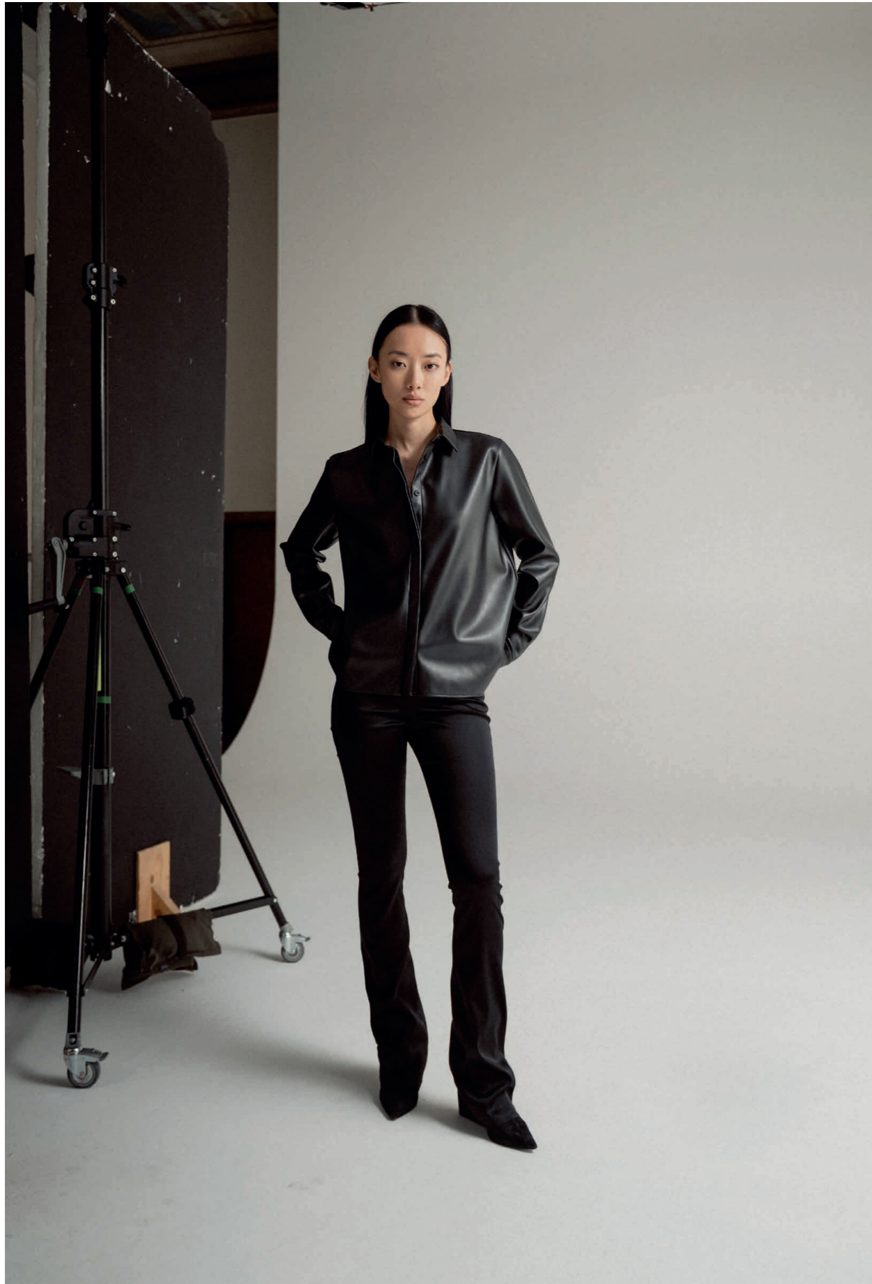
Mia PU leather shirt black, Aiko satin trousers black