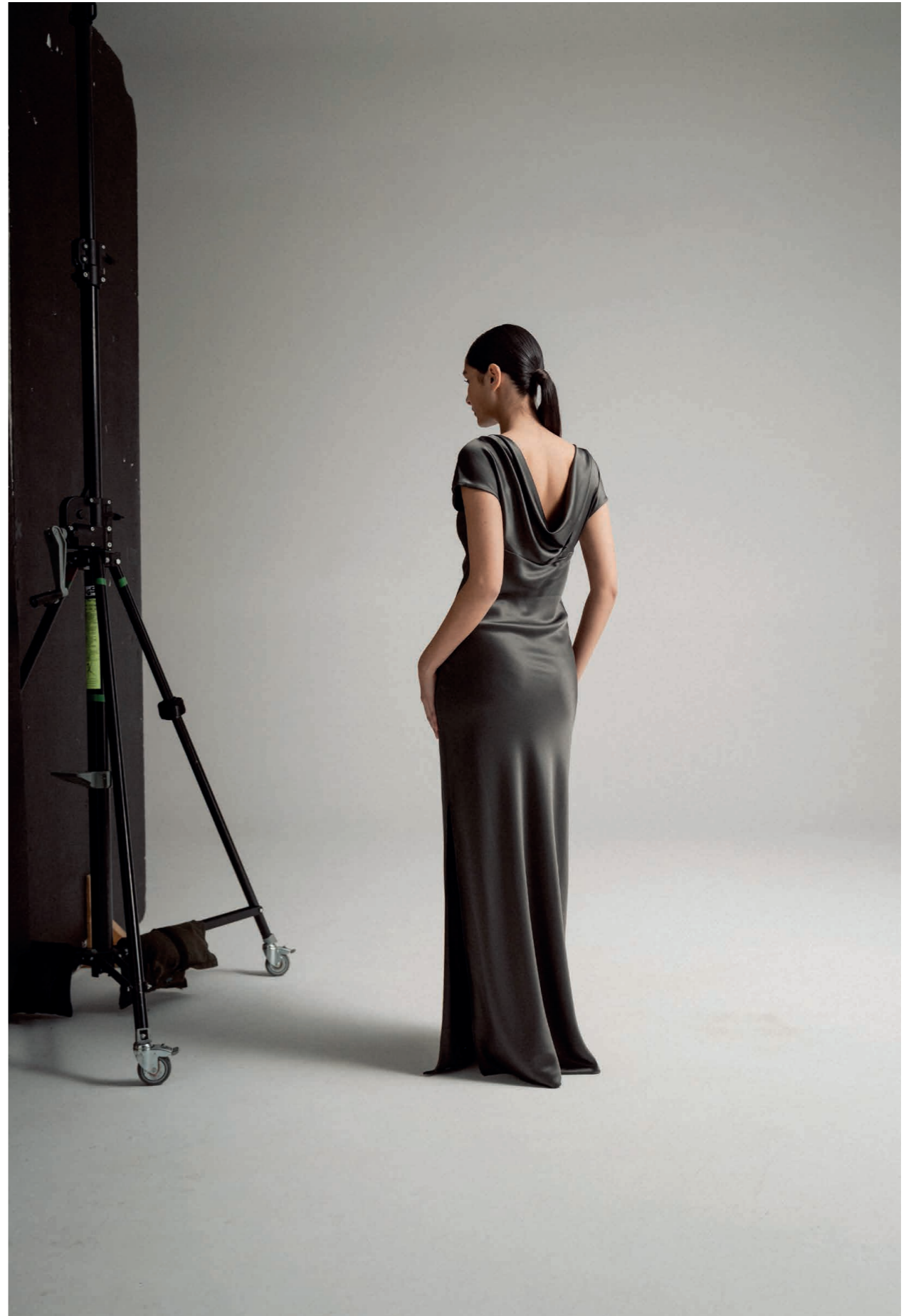
Yuni satin dress wood