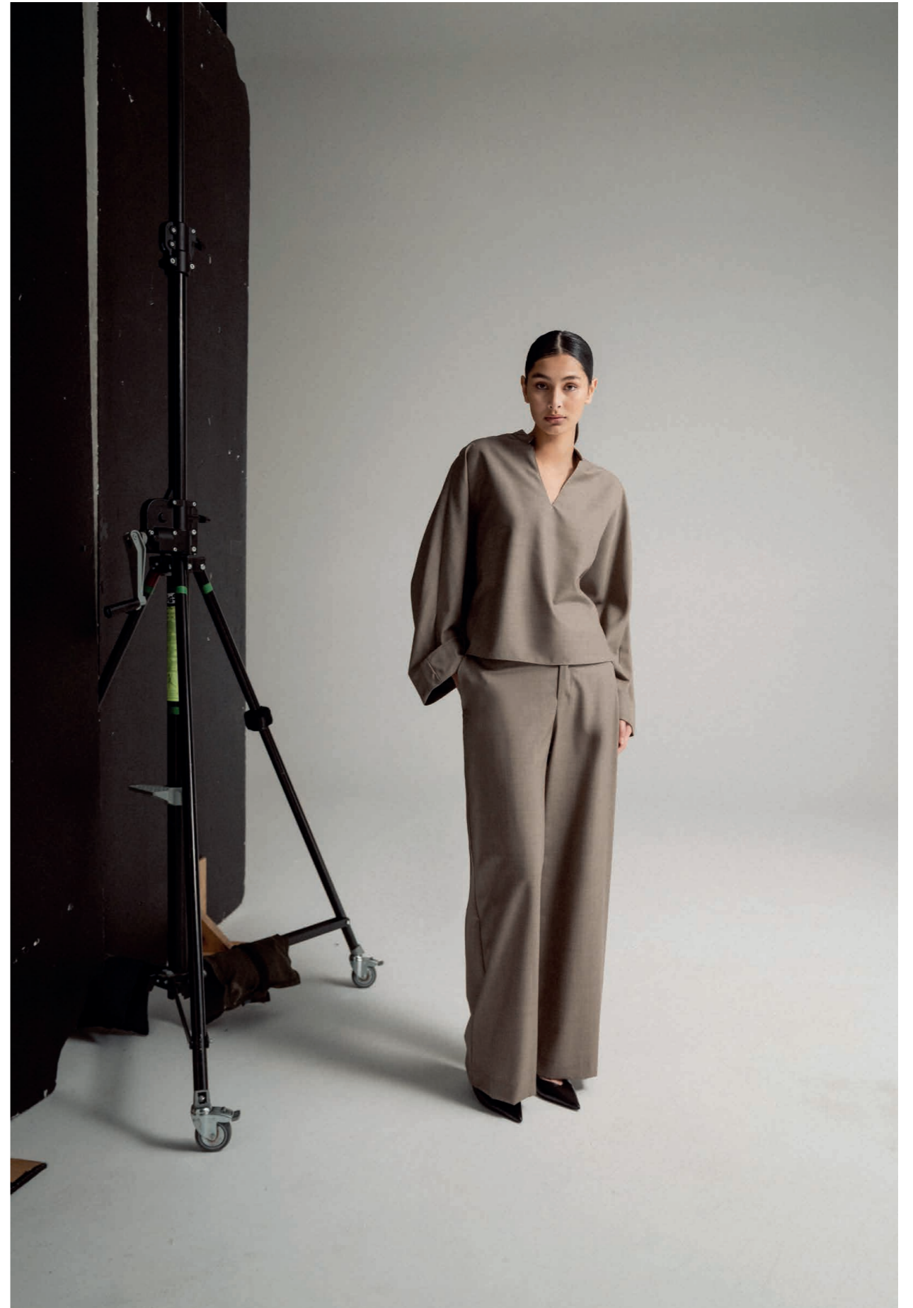
Nina v-neck wool blouse light brown, Mila wool trousers light brown