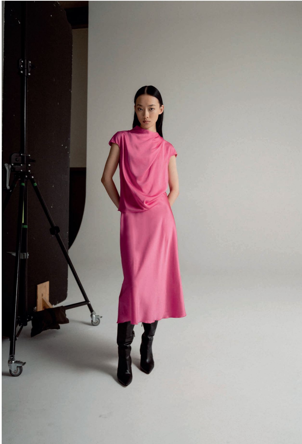
Lima silk top pink, Hana satin silk skirt pink