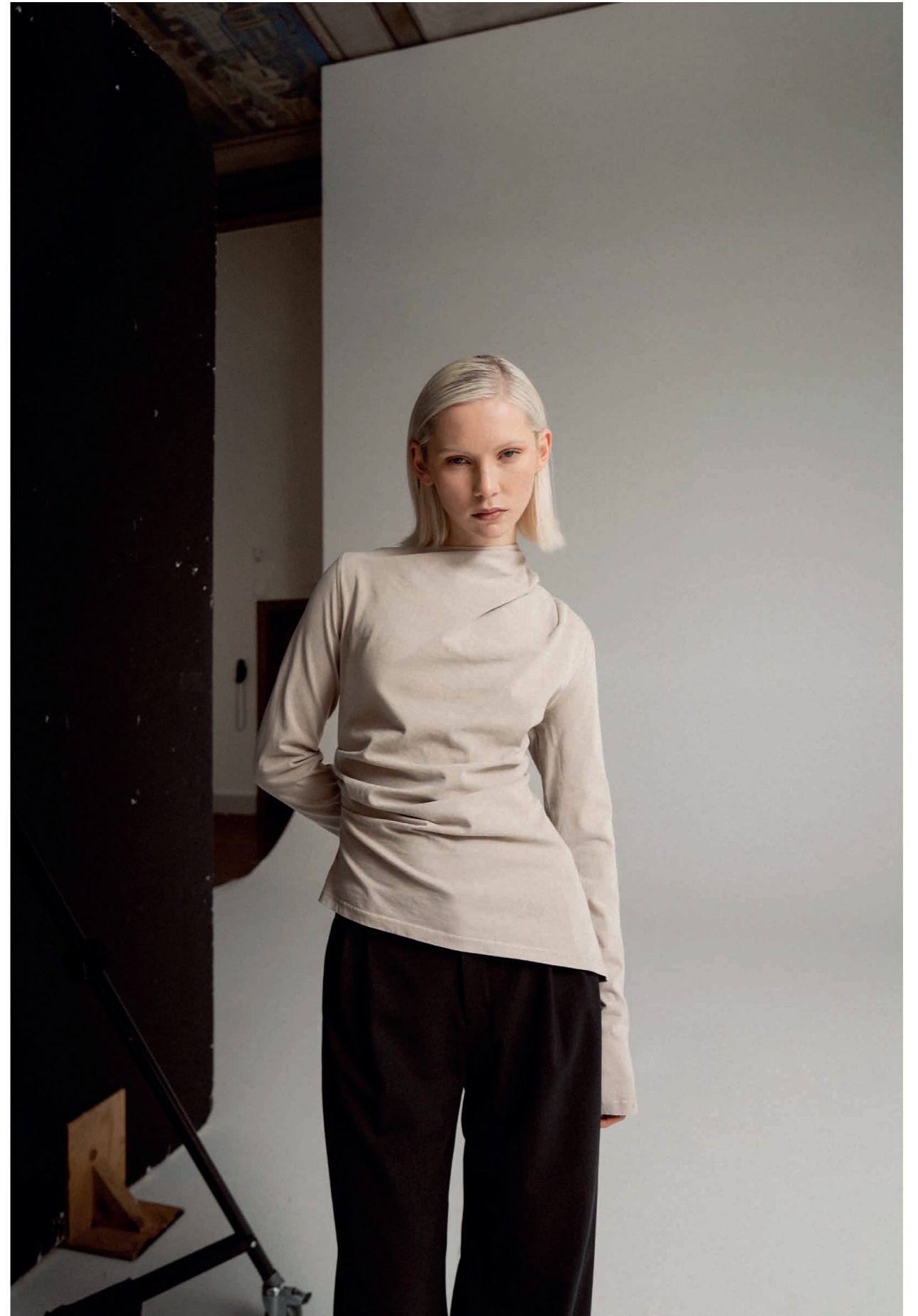
Lizi LS jersey tee washed greige, Mel wool trousers black