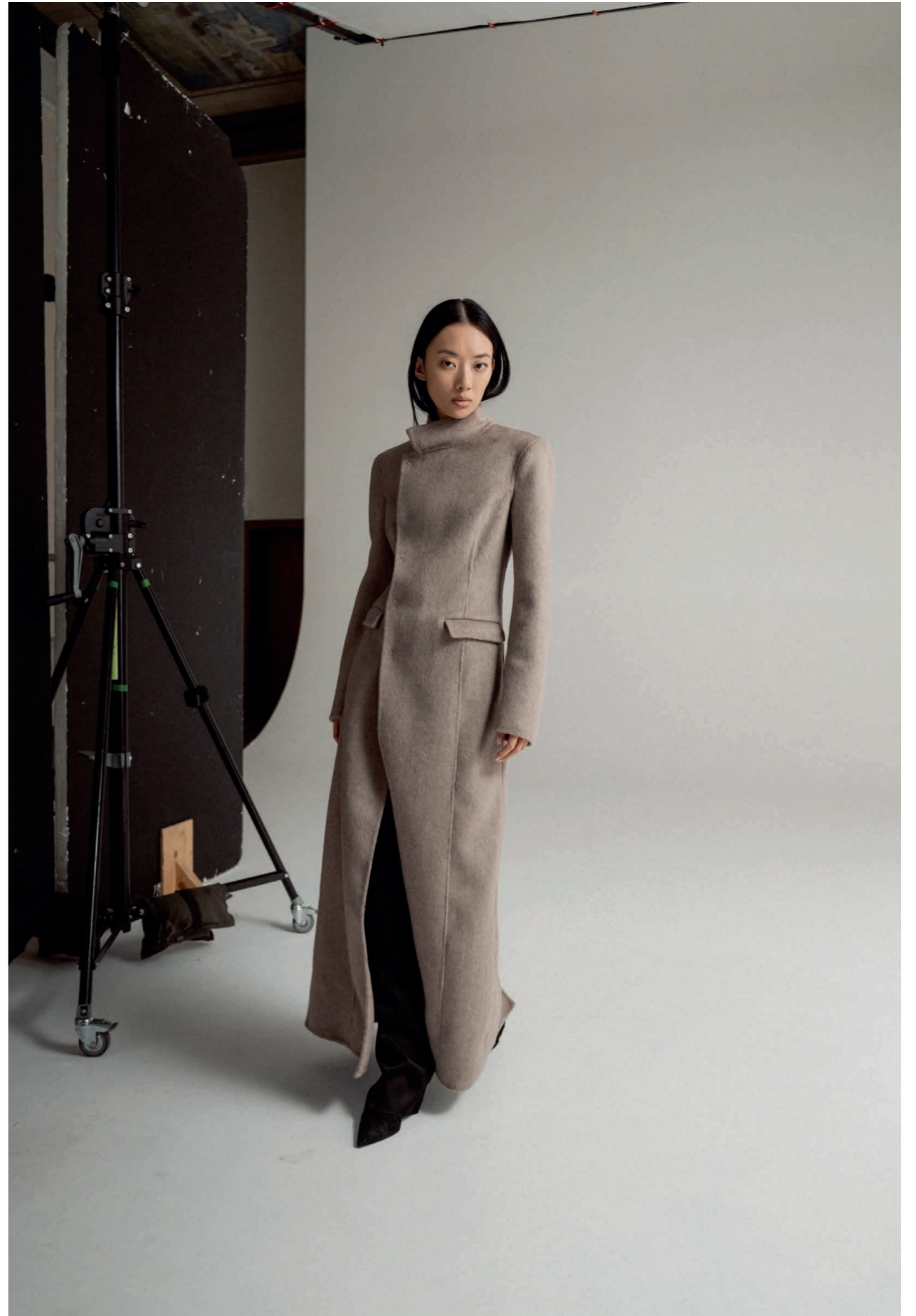
Leia wool coat light brown