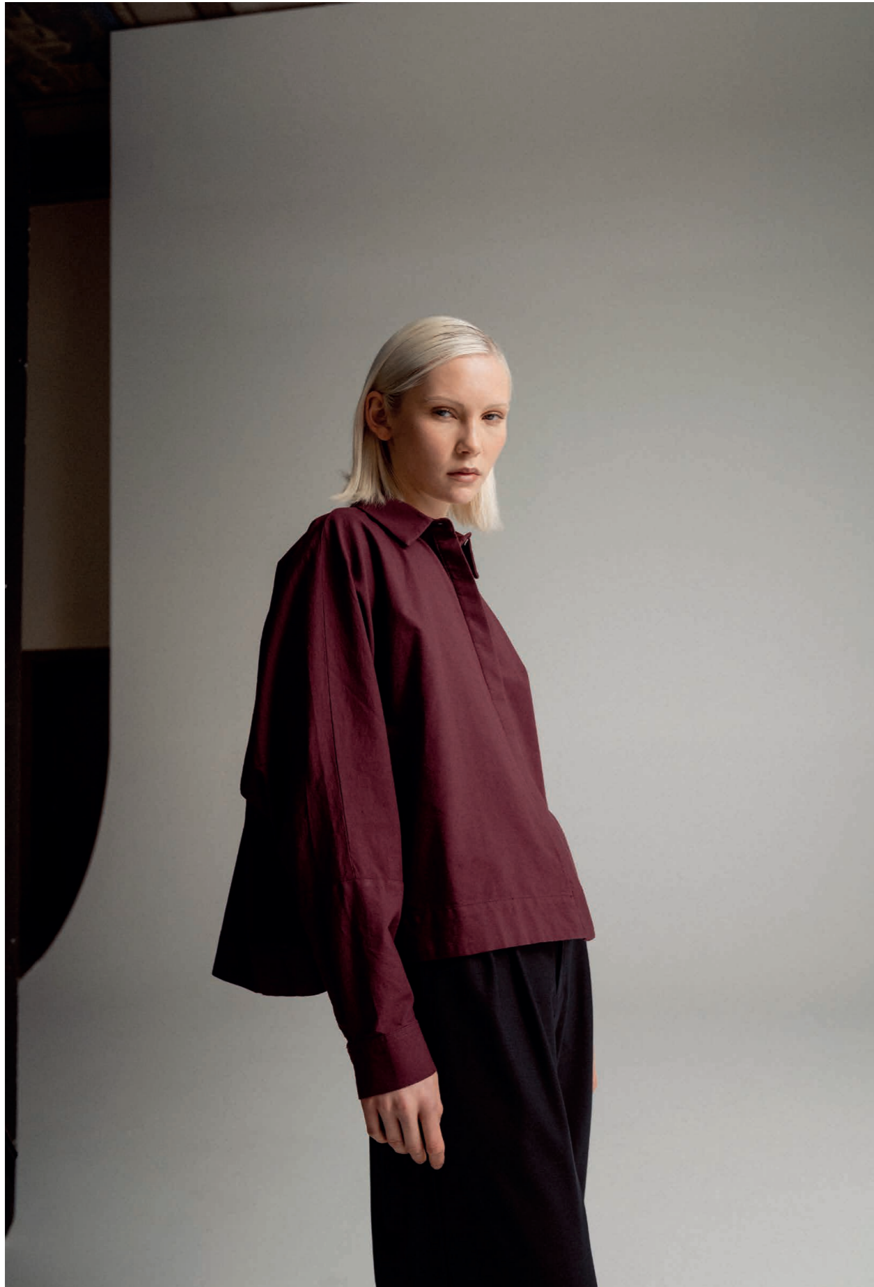
Gigi oxford shirt burgundy