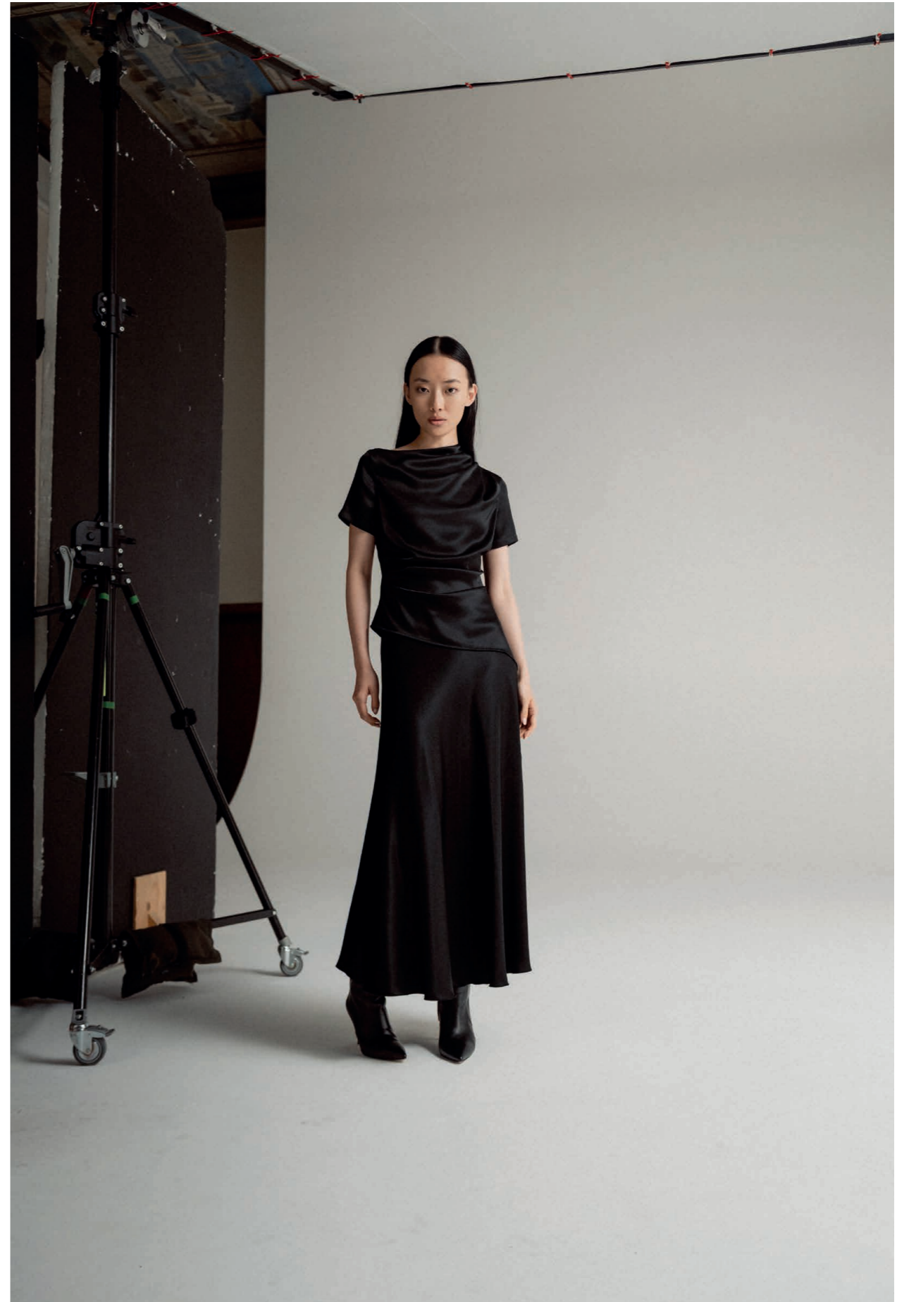
Lizi satin tee black, Hadi satin skirt black