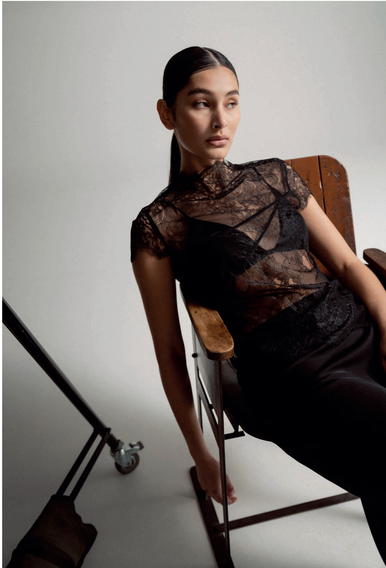
Eden lace top black