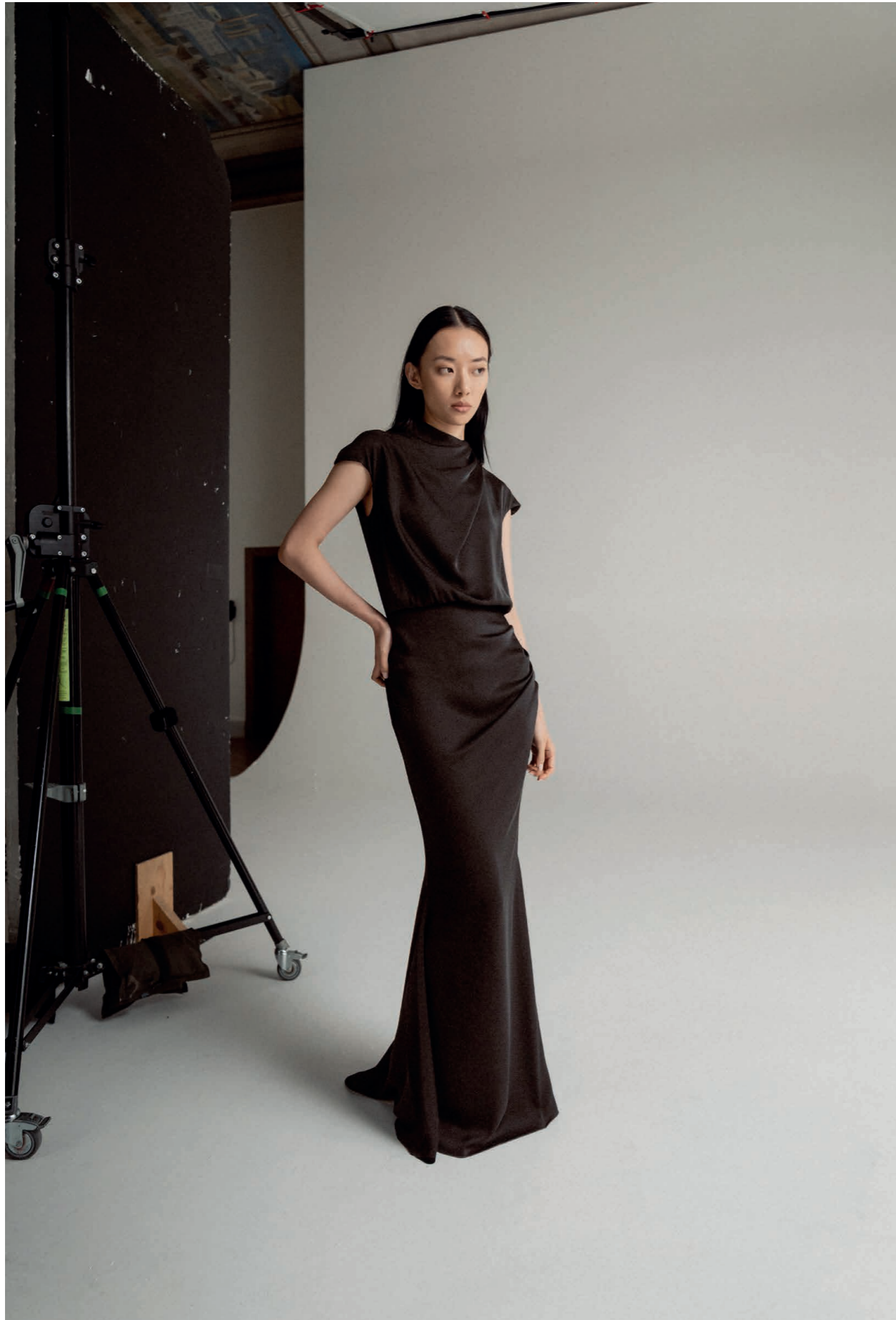
Myra dress black