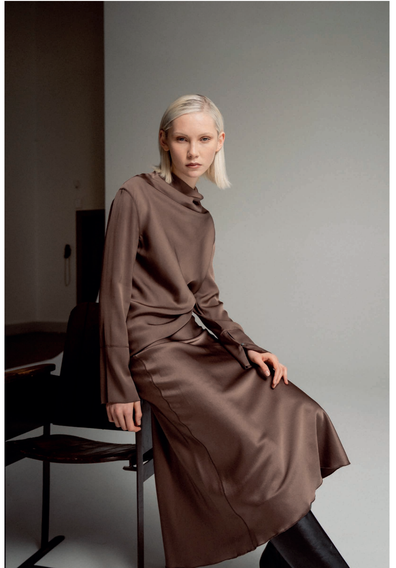
Ayumi silk blouse light brown, Hana satin silk skirt light brown