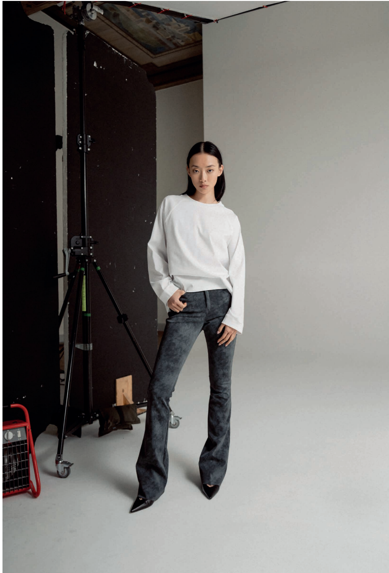
Thelma LS tee white, Aiko PU leather trousers dark grey