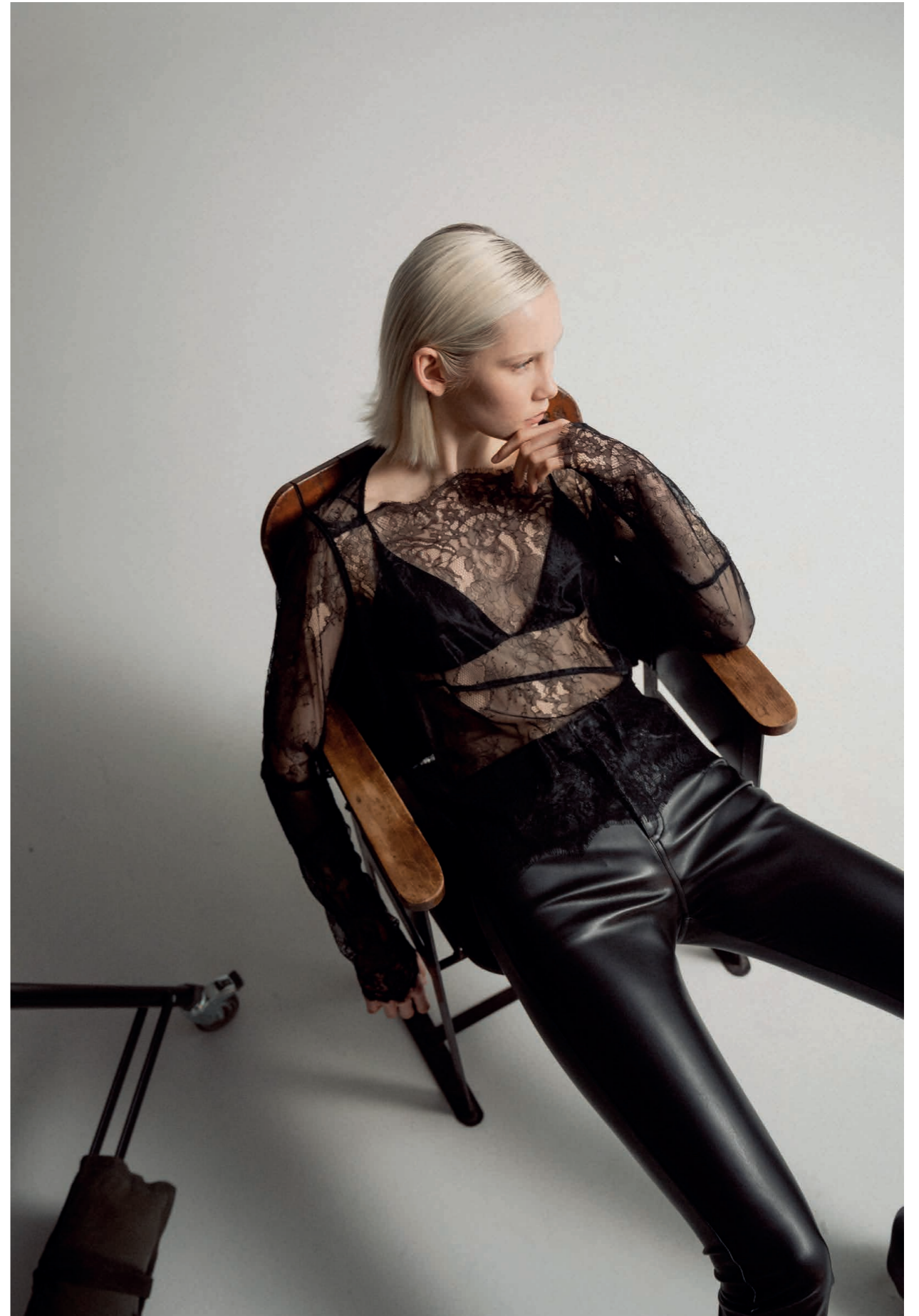
Della lace blouse black, Aiko PU leather trousers black